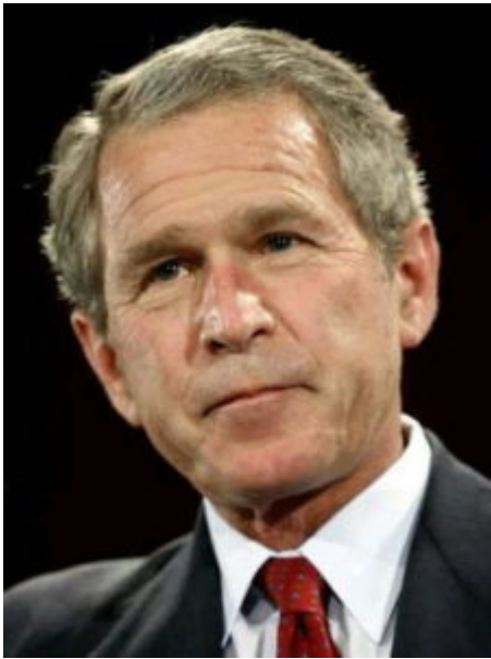
George W. Bush

I thought this was funny and hope you do too. George W. Bush really did say these things in speeches! See: