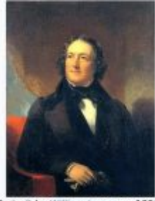
Portrait by William Inman, c. 1830s

Important history of John C. Calhoun and Nicholas Biddle, both Jesuit agents and the American traitors behind the Civil War.