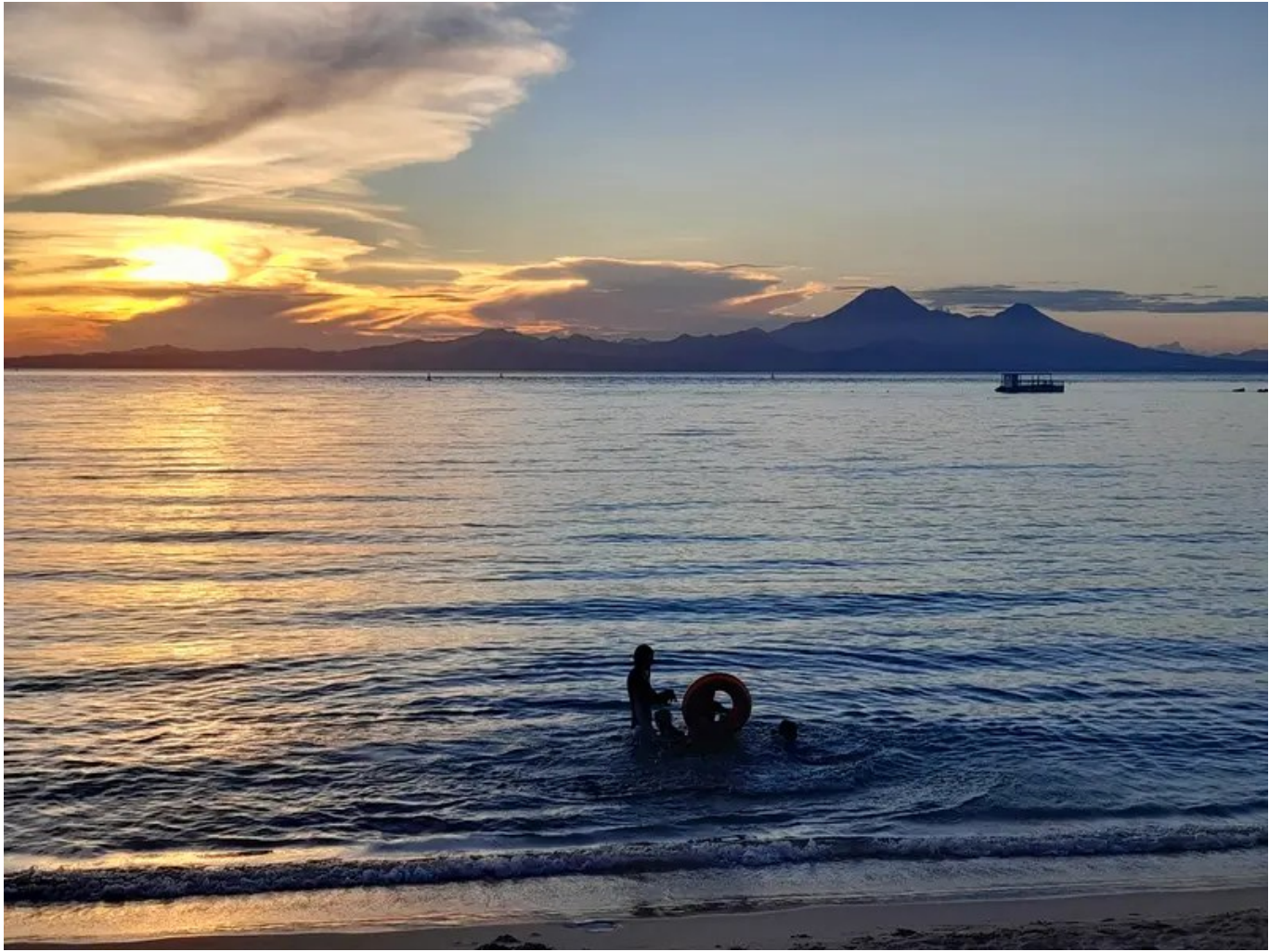
Caba Beach near sunset