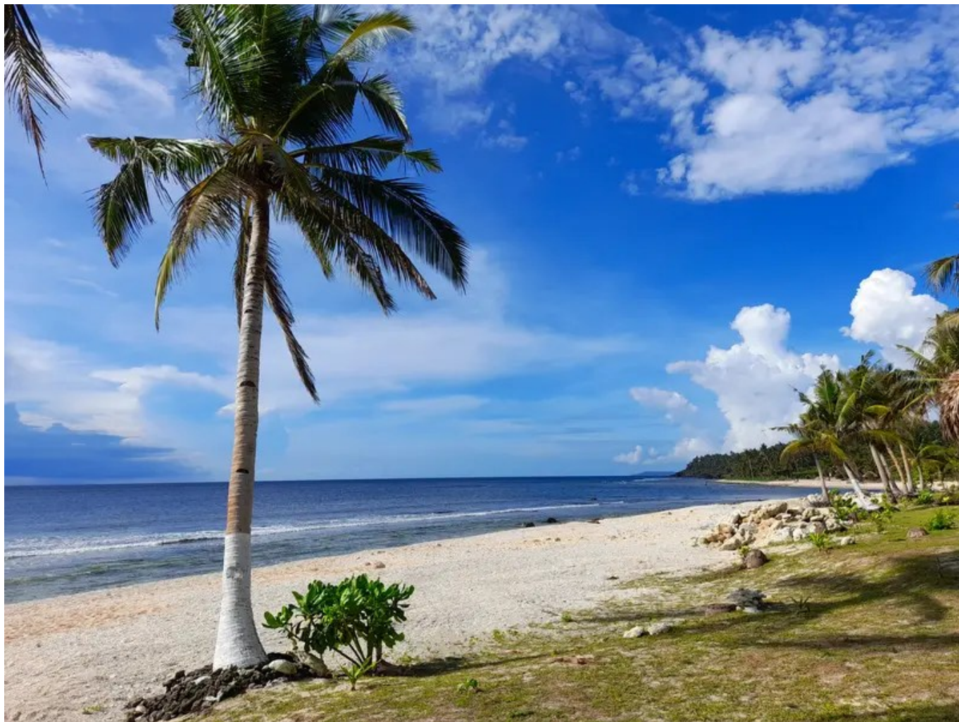
Image White Sand Beach