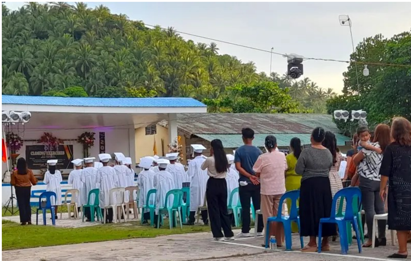
Elementary school graduation ceremony.