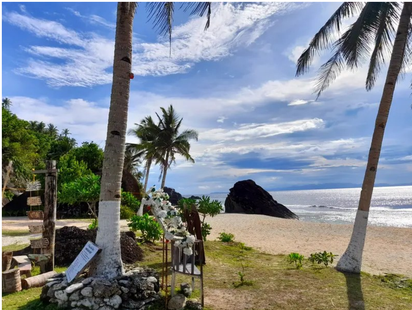
Imaga White Sand Beach rocks in the background.