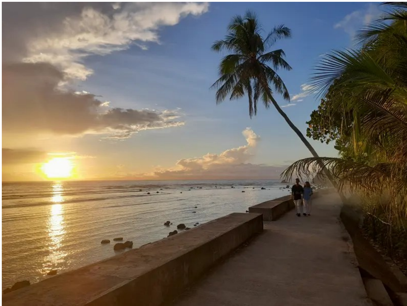
Near Caba Beach