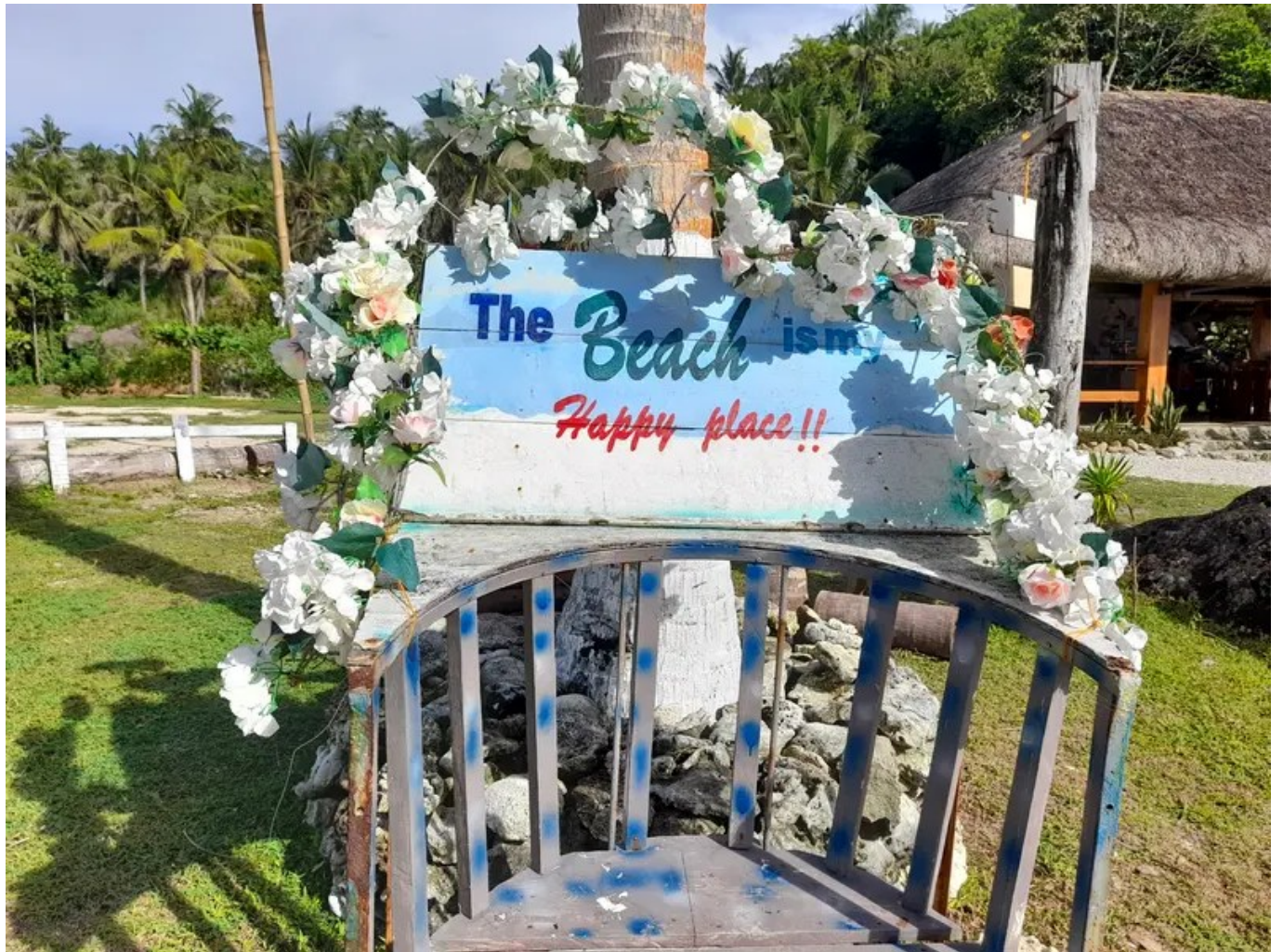
Imaga White Sand Beach sign