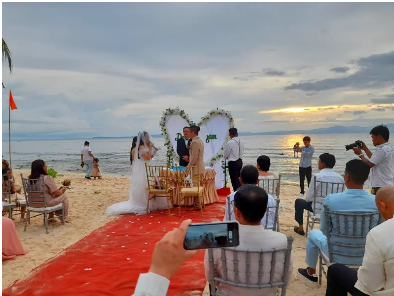
Wedding at Imaga White Sand Beach