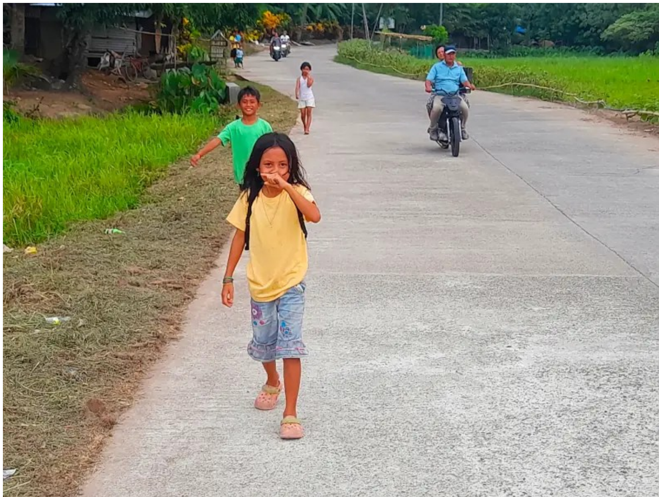
Children walking on the main road to town.