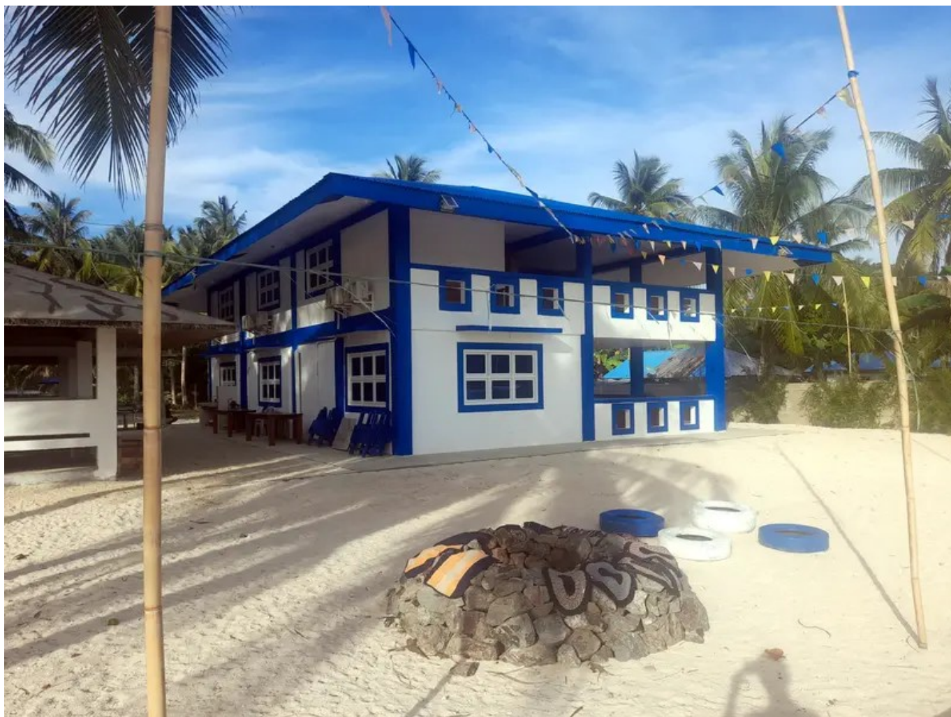
A rich family's house