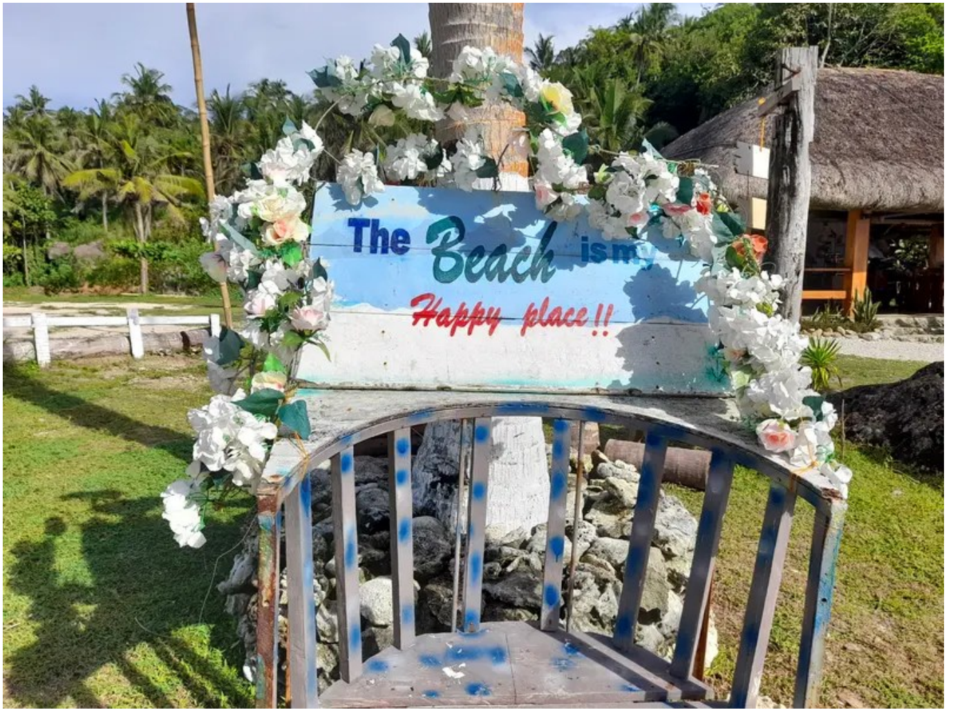
Imaga White Sand Beach sign