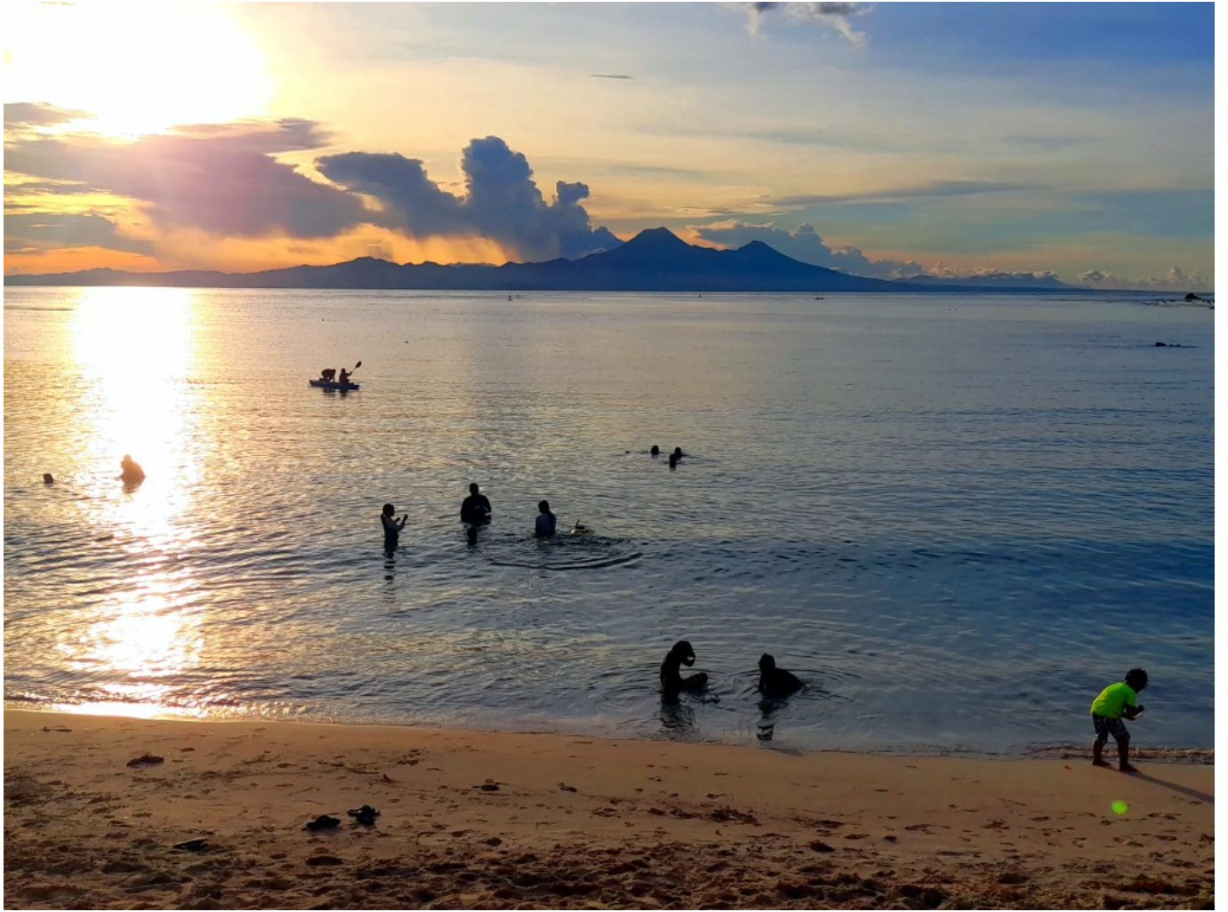
Caba Beach near sunset