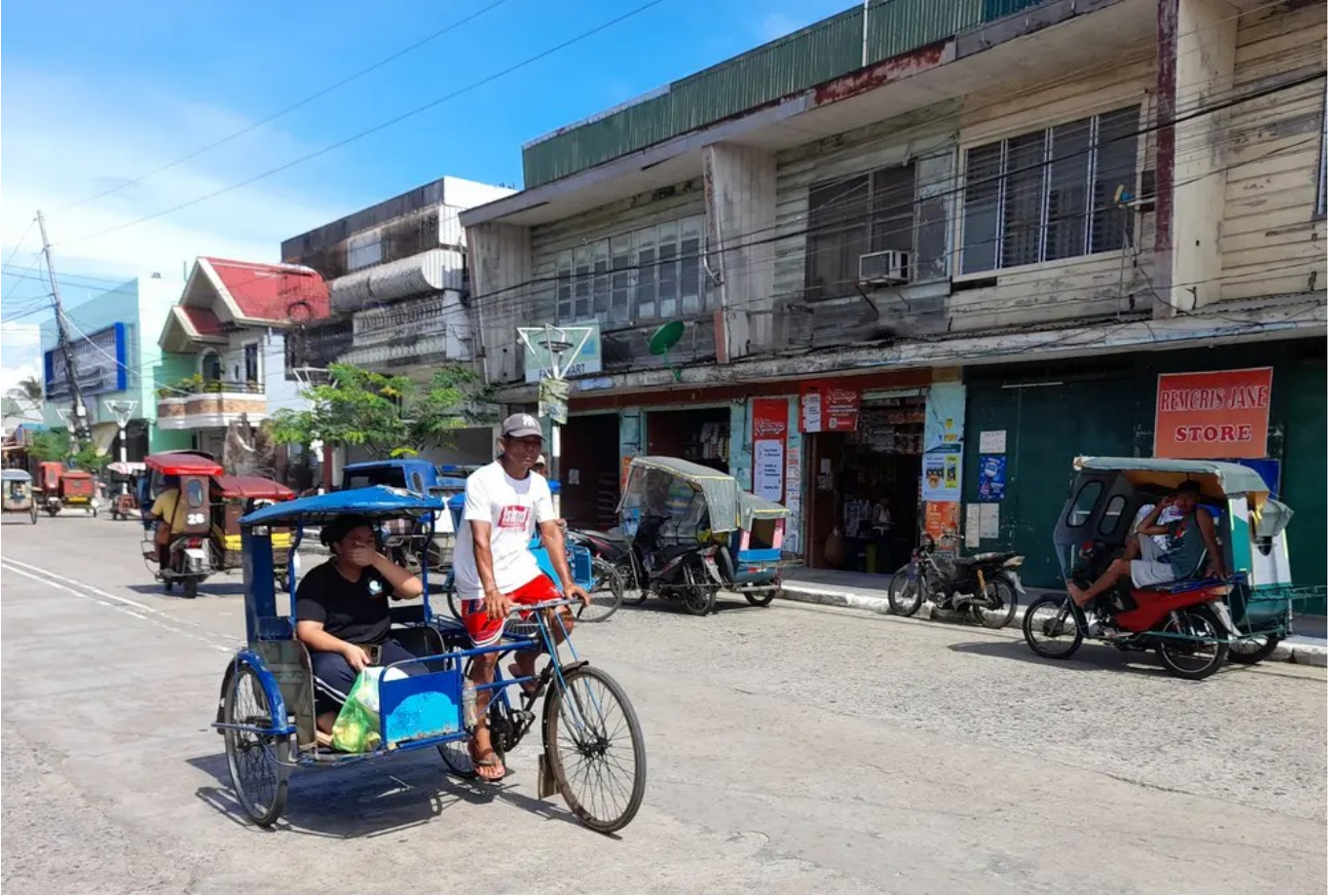
Human powered tricycle taxi in downtown Allen.