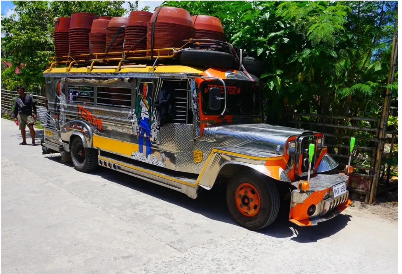
This is a public transportation vehicle called a Jeepney. This one is privately used. I never rode on one because they're not used here. I saw them in Manila.