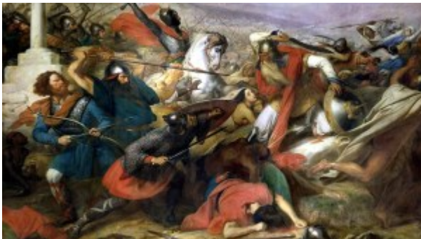
Revelation 9:1-11. The Fifth Trumpet is all about Mohammad and the rise of Islam and the Muslim invaders.