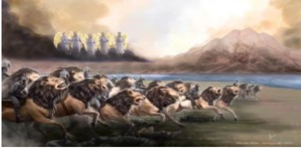
The Turco-Muslims, A.D. 1063