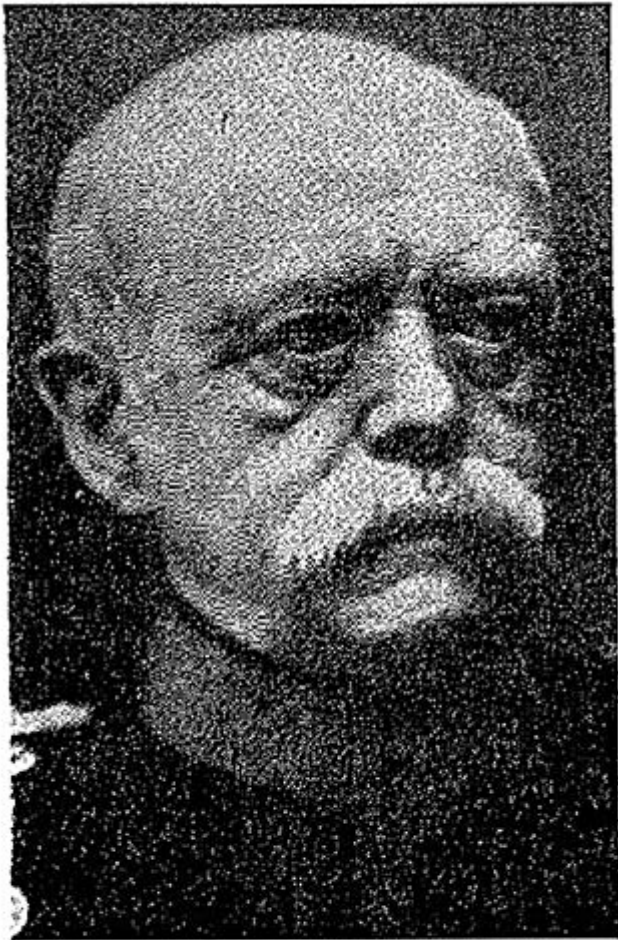
OTTO VON BISMARCK

"It would be difficult to frame a more accurate analysis of the Papal motives, while at the same time indicating a more sweeping denunciation of the Papal policy. Liberal principles, the right of popular government, the German constitution and its guarantee of Parliamentary institutions, says the Pope, may go to the dogs, if we can secure some further modification of the laws which relate to the Church, and so improve the condition of the Papacy in Germany."