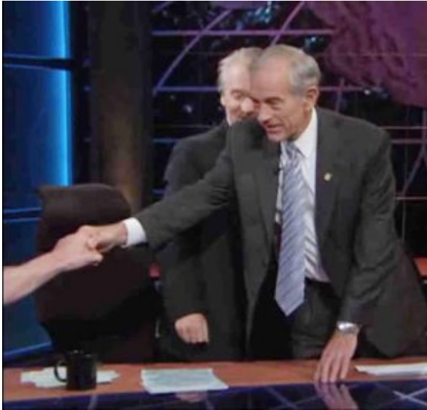
Ron Paul giving a Masonic handshake

I found this photo on http://www.abovetopsecret.com/forum/thread354189/pg1