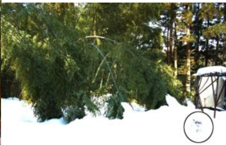
Princess in snow