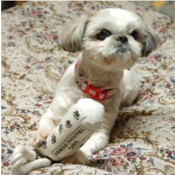
Princess with her toy