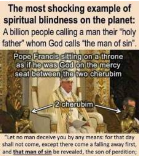
"Let no man deceive you by any means: for that day shall not come, except there come a falling away first, and <u>that man of sin</u> be revealed, the son of perdition; Who opposeth and <u>exalteth himself</u> above all that is called God, or that is worshipped; so that he <u>as God</u> sitteth in the temple of God, shewing himself that he is God." 2 Thessalonians 2:3-4

Because of the fascination of the world with the office of the Pope and his power, it is important to study the topic historically and in the light of Biblical truth. This article is an overview of the history of the Papacy from its inception to rule of Pope John Paul II. A biblical analysis of the basis on which the Office of the Papacy claims to be the Rock of Matthew 16:18 is found on our Webpage: www.bereanbeacon.org