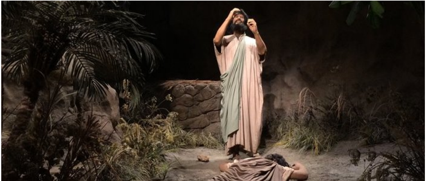
God speaking to Cain.

Abel! Cain was the firstborn and he was Abel's superior. Cain had the birthright, not Abel. But in spite of the Lord's encouragement to him, his envy of his younger brother still got the best of him and he killed him. In spite of the fact the Lord tried to lift up Cain's spirit so he wouldn't sin, Cain's pride and jealousy caused him to sin anyway! So sad!