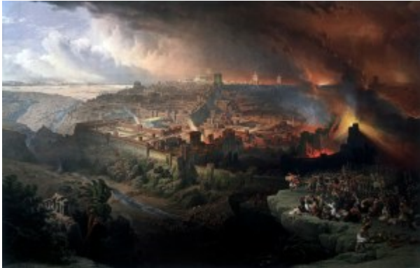
The siege and destruction of Jerusalem by Rome in 70 ad.

I've covered in other articles how the Olivet Discourse in Matthew 24 has been falsely interpreted to be an End-time event by most evangelicals today. However, because I kept hearing false interpretations about it from people close to me, I felt the need to write something short and thought-provoking to try to lead my fellow brothers and sisters to a deeper and correct understanding of what Jesus was saying to His disciples. I hope to convince you from the Scriptures alone that the Great Tribulation He spoke of in Matthew 24 is NOT an End-time event.