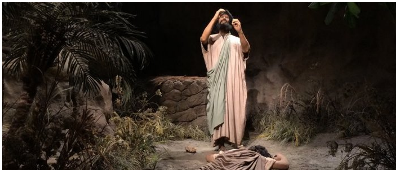
God speaking to Cain.