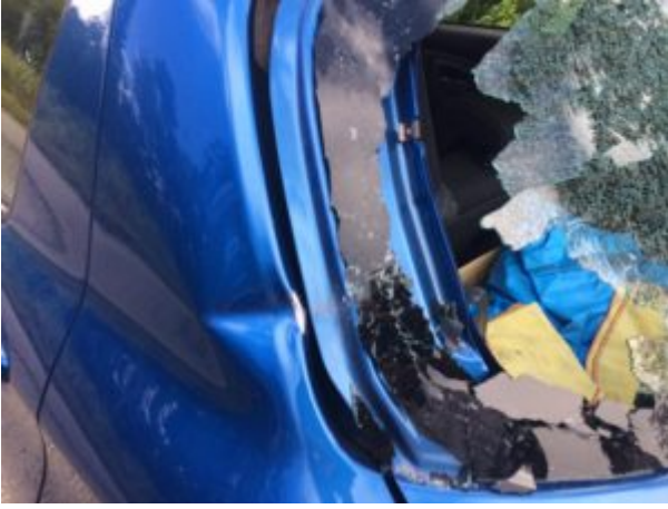
Closeup of rear window.