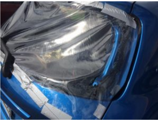
Plastic sheet attached with duct tape over the rear window to keep the rain out.