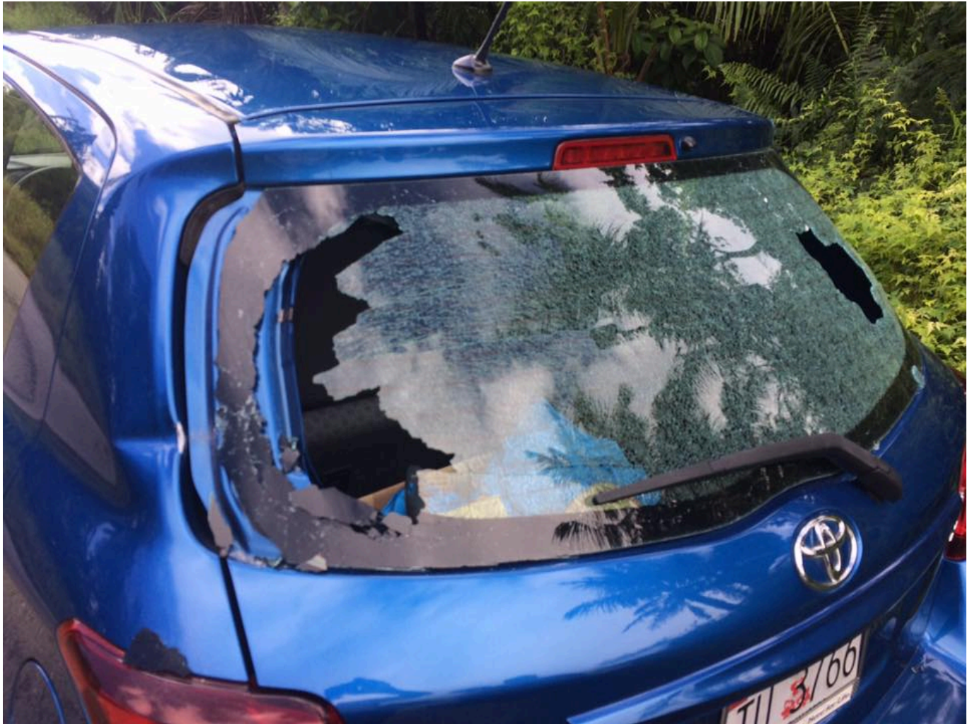
Rear window of my Toyota Yaris after the baseball bat attack.

On June 20th, 2019, just after I took my father-in-law to his home in Piga Subdivision from the Dededo Senior Citizen's Center on the island of Guam, after turning right onto the main road of Chalan Koda, I saw a car ahead that was stopped about 50 meters from the intersection. I drove around the car on its left and then saw a man standing in the middle of the road holding a baseball bat. As I drove slowly past the man, he violently swung his baseball bat and smashed the rear window of my Toyota Yaris! Imagine my shock! This is the stuff of nightmares! I found out later that the driver of the car I went around had stopped and even backed up because the man with the baseball bat was throwing rocks at him!