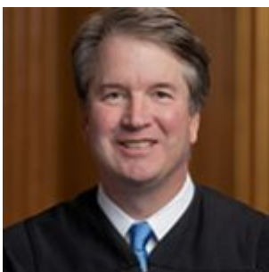
Brett M. Kavanaugh

Neil M. Gorsuch, Associate Justice, President Donald J. Trump, Republican, nominated him as an Associate Justice of the Supreme Court, and he took his seat on April 10, 2017. Episcopalian, raised Roman Catholic