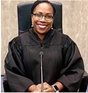
Ketanji Brown Jackson

President George Herbert Walker Bush, Republican, nominated him as an Associate Justice of the Supreme Court and he took his seat on October 23, 1991. Thomas was raised Catholic and attended a Catholic seminary.