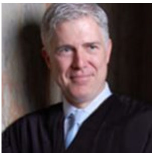
Neil M. Gorsuch

Elena Kagan, Associate Justice, In 2009, President Obama, Democrat, nominated her as an Associate Justice of the Supreme Court on May 10, 2010. She took her seat on August 7, 2010. Kagan is Jewish.