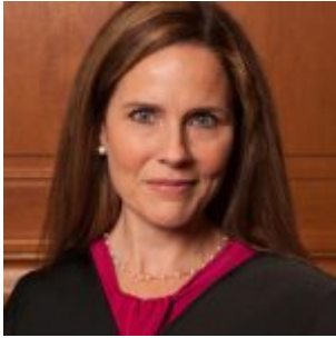
Amy Coney Barrett

Amy Coney Barrett, Associate Justice, President Donald J. Trump, Republican, nominated her as an Associate Justice of the Supreme Court, and she took her seat on October 27, 2020. Barrett is a practicing Catholic .