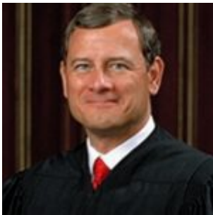
John G. Roberts, Jr.

Six out of nine current Supreme Court Justices were nominated by Republican Presidents! And yet Roe vs. Wade has still not been overturned. And six out of nine are Roman Catholics who are supposed to be against abortion, one is Protestant who should be against abortion, and only one is of a non-Christian faith! All people who call themselves Christians should be against abortion.