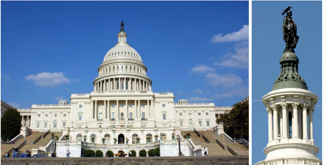
The Capitol with a close up of the statue.

thunderbolts and nourished the earth with his fertilizing rains. If it was a capitolium, it belonged to Jupiter and his priests.