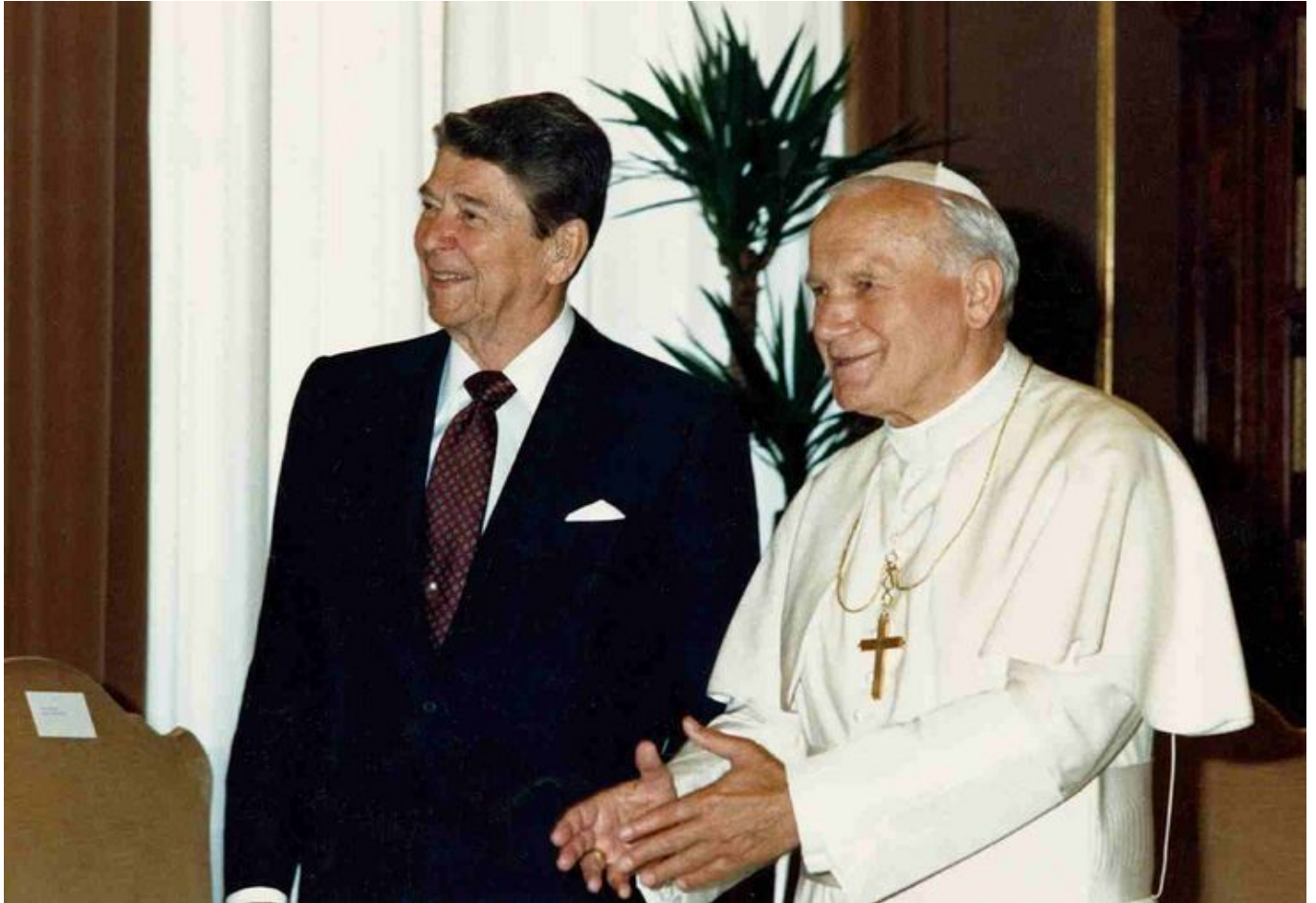
President Ronald Reagan with Pope John Paul II

communism, at least one reader saw through the hype.