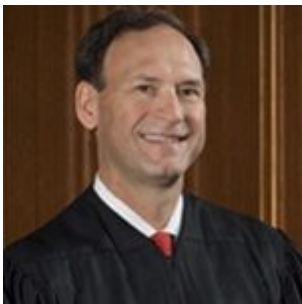
Samuel A. Alito, Jr.

Ketanji Brown Jackson Associate Justice, On February 25, 2022, President Joe Biden nominated Jackson to be an associate justice of the Supreme Court of the United States. Jackson is an independent Protestant according to Wikipedia, but probably not a real born-again Christian because she will not define the word “woman.” She’s probably Woke.