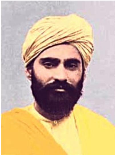
Sadhu Sundar Singh

“I Have Decided to Follow Jesus” is a Christian hymn that originated in Assam, India.