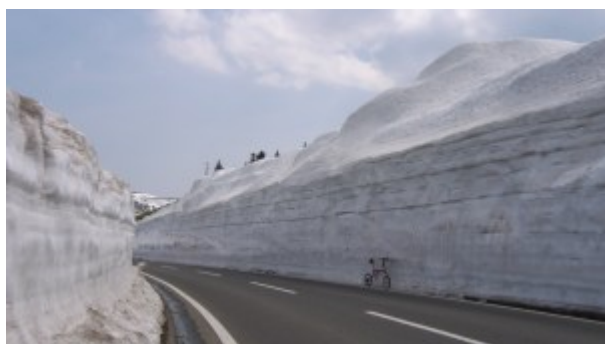
Walls of snow along road in Japan

February 1, 2011: I started out very well with the first ride on my trip to Noda city in Chiba prefecture, just east of Tokyo. The purpose of this trip was to attend a fellowship meeting at 7 PM. It was good weather and I left home at a very good time, just after 10 AM. Tokyo is 300 kilometers away but it usually takes me less than 6 hours, only half a day. I found that weekends