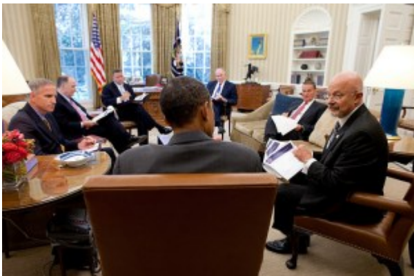
President Barack Obama meets with Director of National Intelligence James