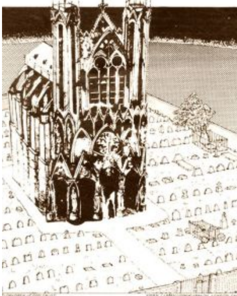
The false church