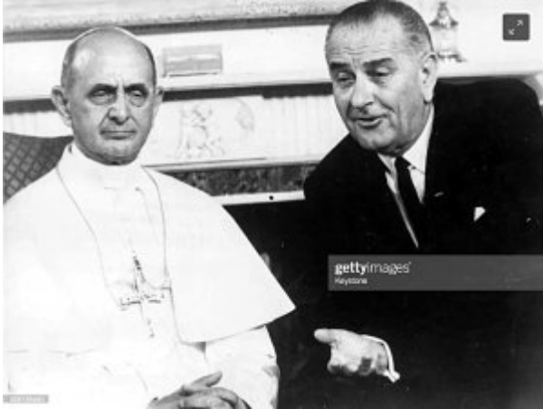
Lyndon Johnson with Pope Paul VI