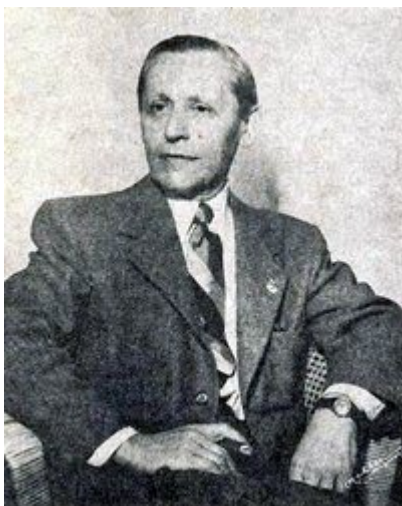
Myron C. Fagan

Myron Coureval Fagan (October 31, 1887 – May 12, 1972) was an American writer, producer and director for film and theatre and a red scare figure in the late 1940s and 1950s. Fagan was an ardent anti-communist. Fagan arrived on Broadway in 1907, where he quickly became one of the younger playwrights in American theater. Over the years, he worked in the theater with Alla Nazimova, Douglas Fairbanks, and John Barrymore. He also directed plays for the producers such as Charles Frohman, David Belasco. Fagan also became the dramatic editor of the Associated Newspapers. Many of the actors, including Humphrey Bogart, Brian Donlevy and Robert Ryan, whom Fagan directed or who appeared in his plays or screen adaptations, later became stars in Hollywood. (Quoted from Wikipedia)