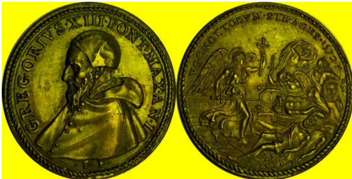
Obverse and Reverse of the St. Bartholomew Medal. PAPAL ROME Offering French Protestants the alternative of the CRUCIFIX or the SWORD.

this dispensation. This prophecy implies that she has daughter churches also, such as the High Church of both England and Scotland, the clergy of which celebrate Mass, hear confessions, burn incense, creep to and adore the cross. offer up prayers for the dead, and conduct their services arrayed in the millinery, robes and colors of Rome. Most of Rome's "converts" come from these churches after having first tampered with her Babylonish practices, ritual, ceremonies, and wine, and thus first been made drunk , or in other words, robbed of their sober senses, and made incapable of distinguishing between truth and error. This explains why otherwise well balanced and scholarly men are ensnared at times by this "Church;" as the Scriptures affirm, she makes them drunk . This is no mere empty figure of speech. What other condition of heart or mind could lead intelligent and even scholarly men to believe and propagate so vehemently the doctrine of the pretended Real Presence of Christ in the bread and wine after so called consecration? The secret of it all is, that there is a mighty deceiving satanic spirit behind this doctrine which drowns the reason. This explains why men are so mightily gripped by this strange idolatrous doctrine.