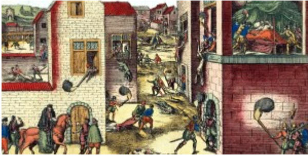
St Bartholomews Massacre In 1572