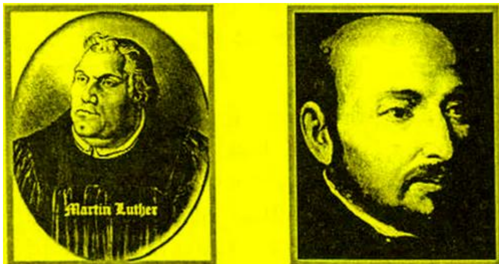
Martin Luther and Ignatius Loyola