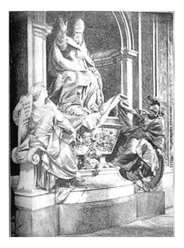
The tomb of Pope Gregory XIII which celebrates the Gregorian Calendar reform.

The intended symbolic meaning, however, is undoubtedly that of Aries the Ram, the first sign of the Zodiac, which symbolizes the Vernal / Spring Equinox, and Draco / Drako (or Ouroboros) the serpent depicting a cyclical returning. Pope Gregory XIII had modified the calendar specifically so that the Vernal Equinox would remain relatively constant, on or about March 21st, which is the beginning of the Zodiacal year, when the Sun crosses the Equator and enters the astrological sign of Aries. This had the desired result of returning Easter to the time specified by the Nicene Council (325 A.D.).