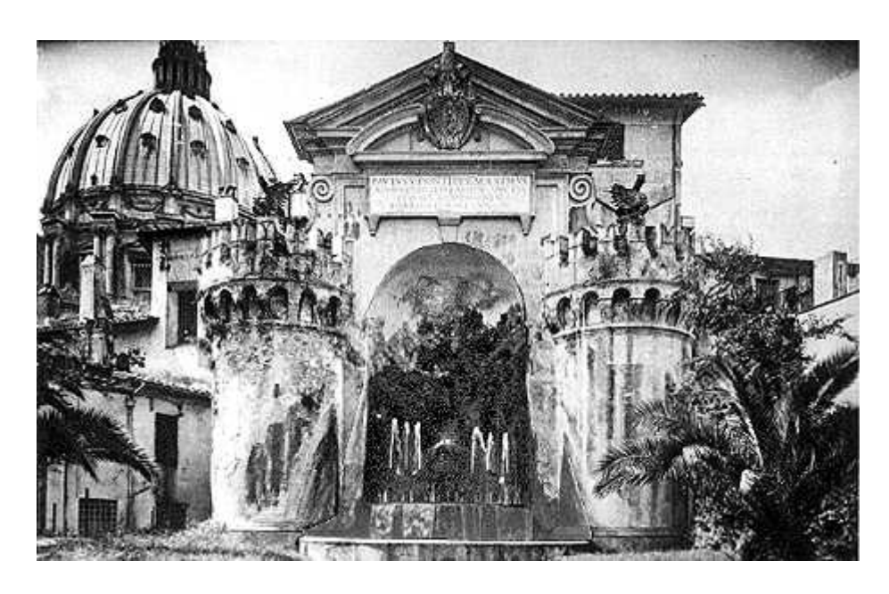
Fountain of Towers, Vatican Gardens

Because it somewhat resembles an altar, this fountain has also been called the Fountain of the Sacrament, or in Italian, Fontana del Santissimo Sacramento. The spray of water from the dragon's mouth is said to imitate the rays of a sunburst monstrance.