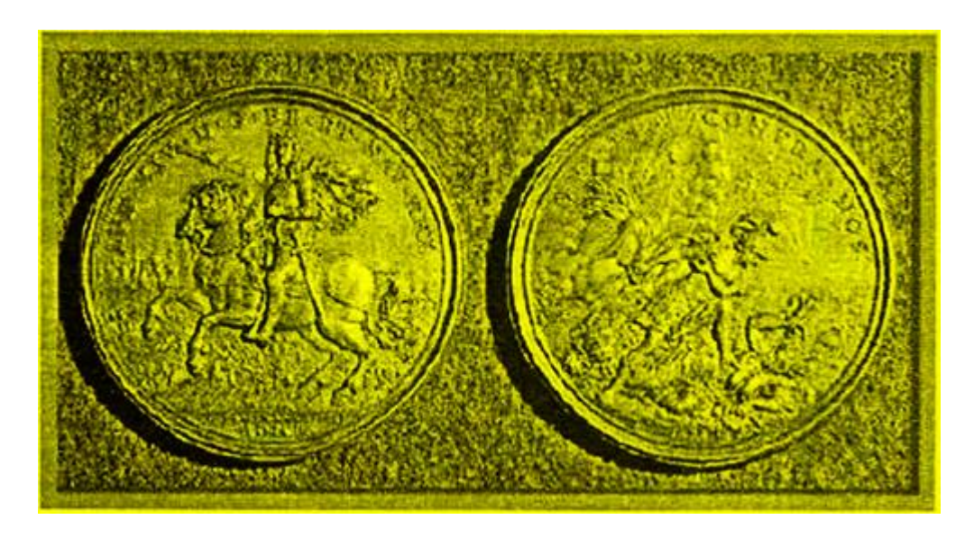
GREGORIUS XIII — PONT. MAX. AN. I UGONOTTORUM STRAGES (HUGUENOTS SLAUGHTERED) — 1572

Pope Gregory XIII, with the dragon of Satan as his heraldic symbol, was also the pope who upon hearing of the wholesale slaughter of Protestant French Huguenots, known as St. Bartholomew's massacre, had a medal struck to celebrate the bloody event. The reverse side of the medal, shown above, depicts an angel with a cross and sword murdering the Huguenot heretics.