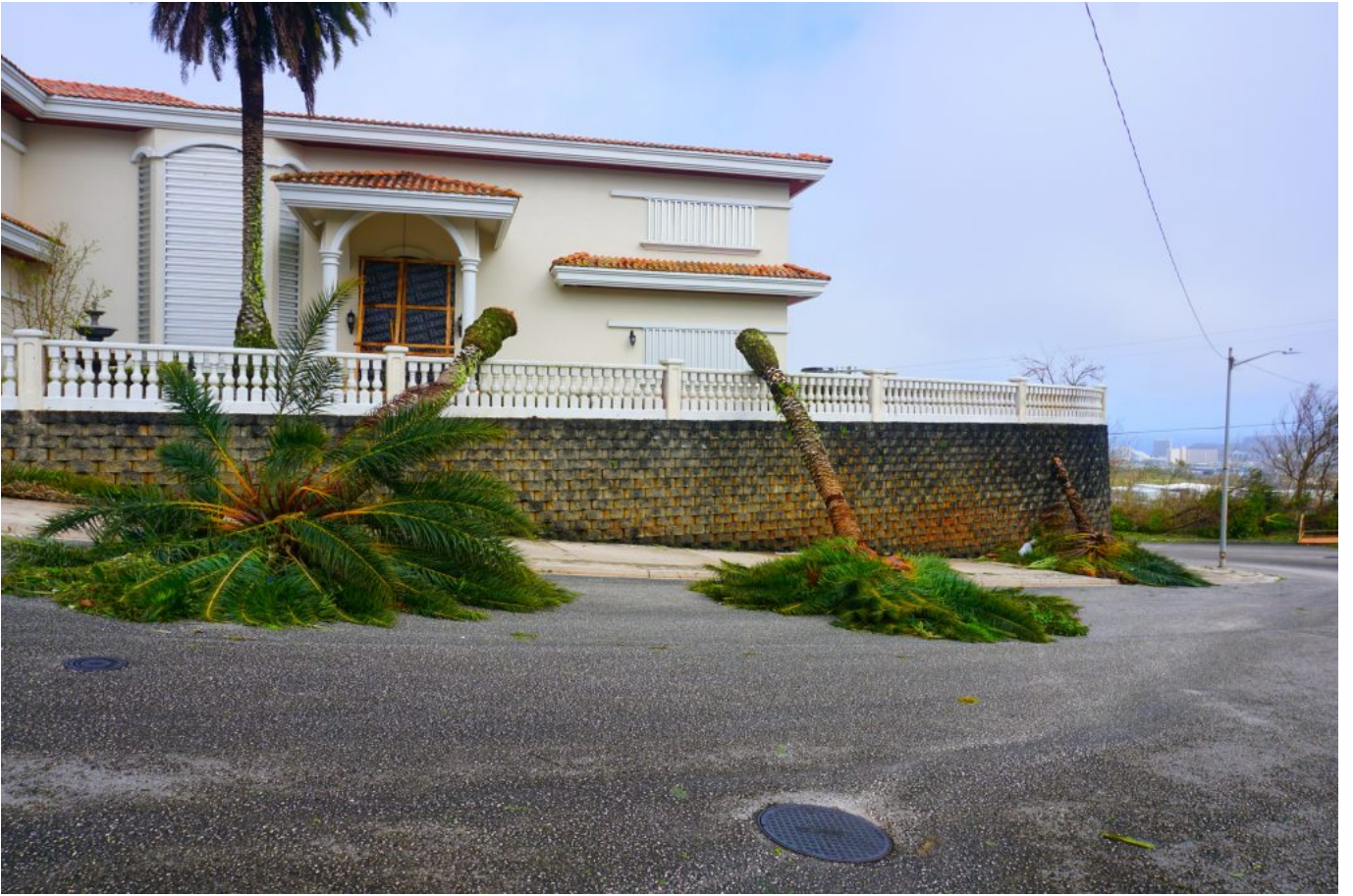
Uprooted palm trees