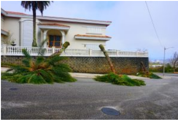
Uprooted palm trees

On Wednesday May 24, around noon local time, Typhoon Mawar hit Guam and gradually increased in strength uprooting trees and destroying dwellings that were not designed to withstand high winds! Electric power was cut. By 10 PM the force of the wind was at its peak. It continued throughout the night and finally subsided mid Thursday.