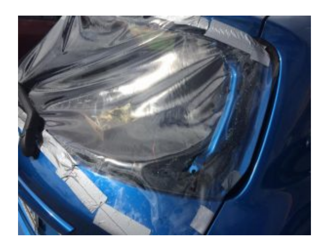
Plastic sheet attached with duct tape over the rear window to keep the rain out.