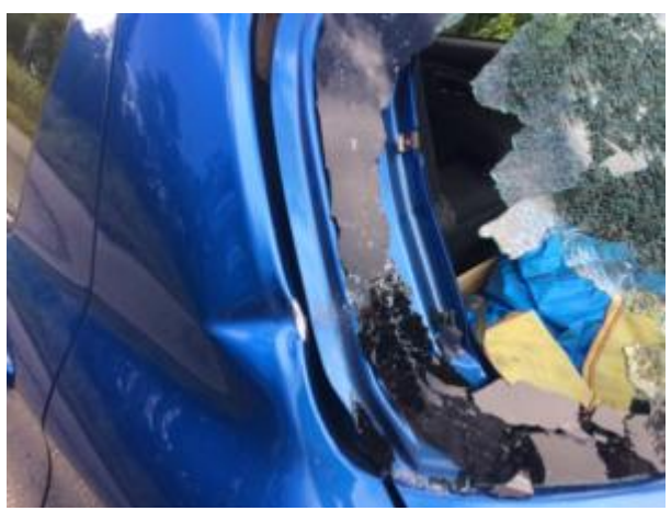
Closeup of rear window.