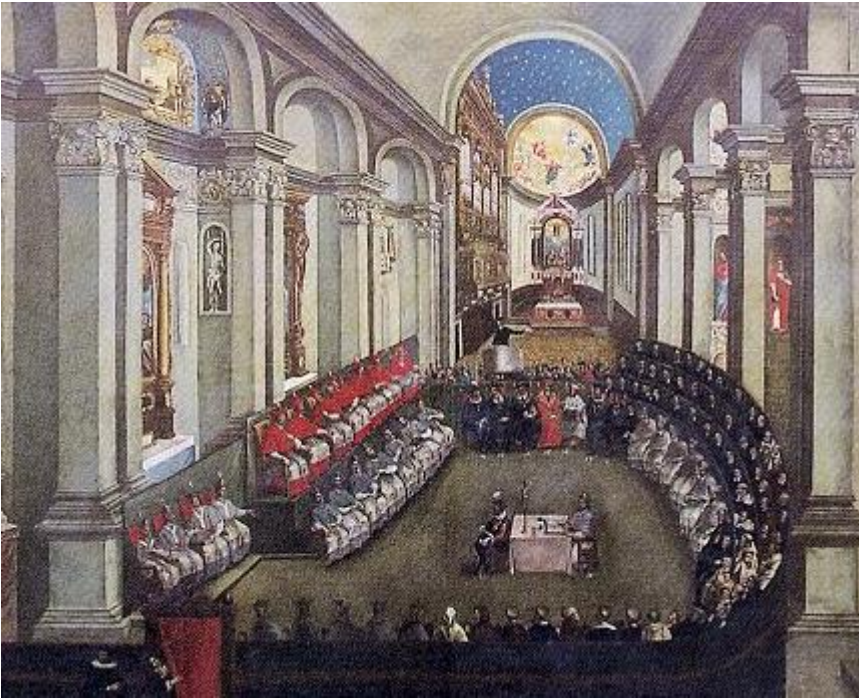
The Council of Trent in the Santa Maria Maggiore church; Museo Diocesano Tridentino, Trento.