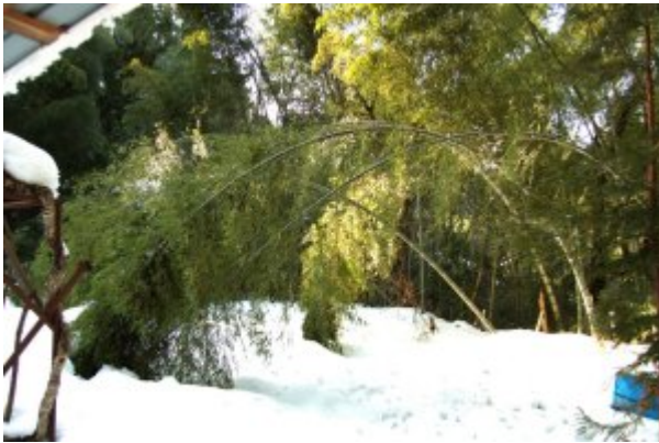
Bamboo bowed over with snow

The photos below shows bamboo trees bent over with the tops stuck in the snow! The snow causes the trees to bend over till the top of the tree touches the snow on the ground. Further snow buries the top branches tying the top of the tree to the ground, and it will stay like that until enough snow on the ground melts, even though the original snow that bent the tree in the first place melts first like it did shown in the photos.