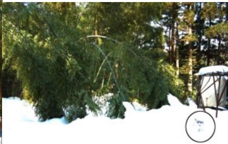
Princess in snow