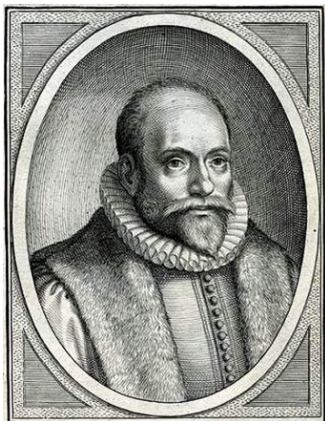
James (Jacob) Arminius

James Arminius (1560-1609) is generally regarded as the founder of the system of Arminianism. He was educated at the new Dutch University at Leyden and then at Geneva under the tutelage of Theodore Beza, Calvin’s well respected follower and successor. Around 1591, after only a year at the Geneva Academy, he began to develop views that were to become diametrically opposed to the doctrines of free and sovereign grace that were taught at Geneva. He departed and continued his education elsewhere. He became a minister in Amsterdam and was later invited to become Professor of Divinity at the University of Leyden. It was from this point that he began propounding his theories with (guarded) vigour.