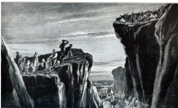
WALDENSES HUNTED BY THE ARMIES OF ROME