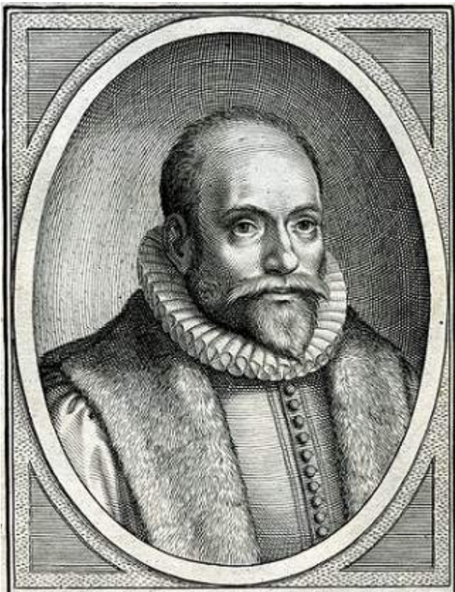
James (Jacob) Arminius

James Arminius (1560-1609) is generally regarded as the founder of the system of Arminianism. He was educated at the new Dutch University at Leyden and then at Geneva under the tutelage of Theodore Beza, Calvin’s well respected follower and successor. Around 1591, after only a year at the Geneva Academy, he began to develop views that were to become diametrically opposed to the doctrines of free and sovereign grace that were taught at Geneva. He departed and continued his education elsewhere. He became a minister in Amsterdam and was later invited to become Professor of Divinity at the University of Leyden. It was from this point that he began propounding his theories with (guarded) vigour.