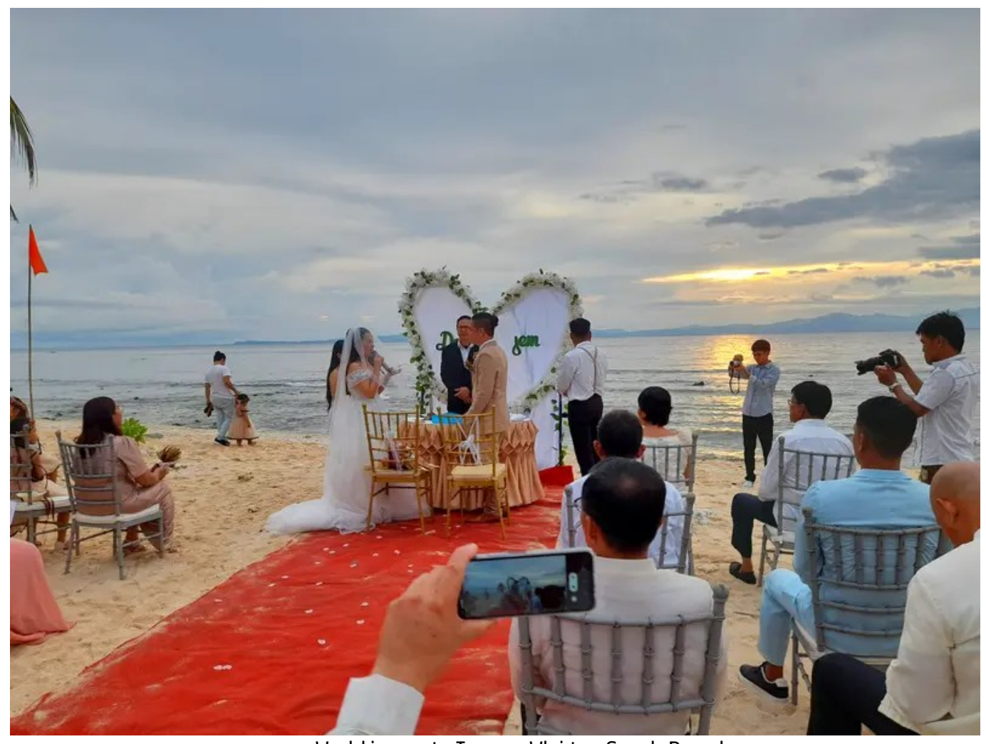
Wedding at Imaga White Sand Beach