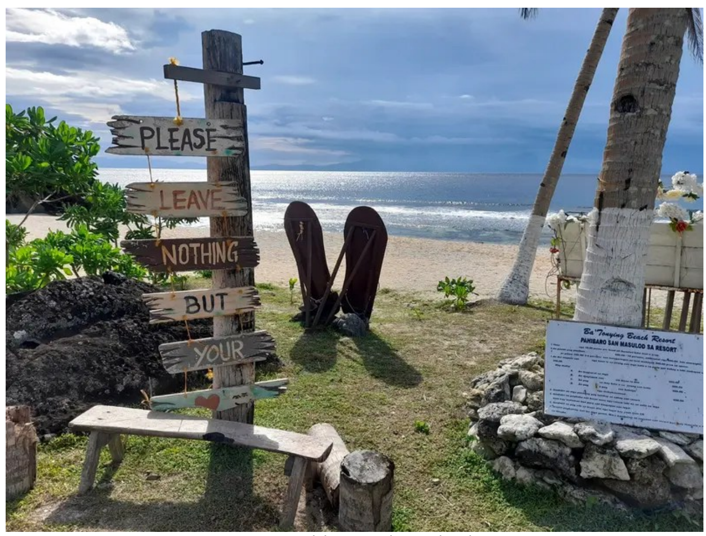
Imaga White Sand Beach sign.