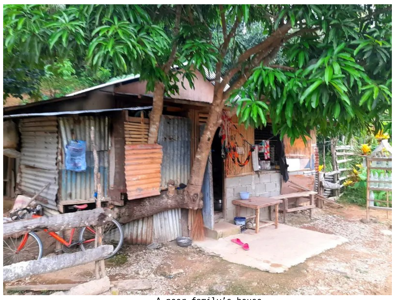
A poor family's house