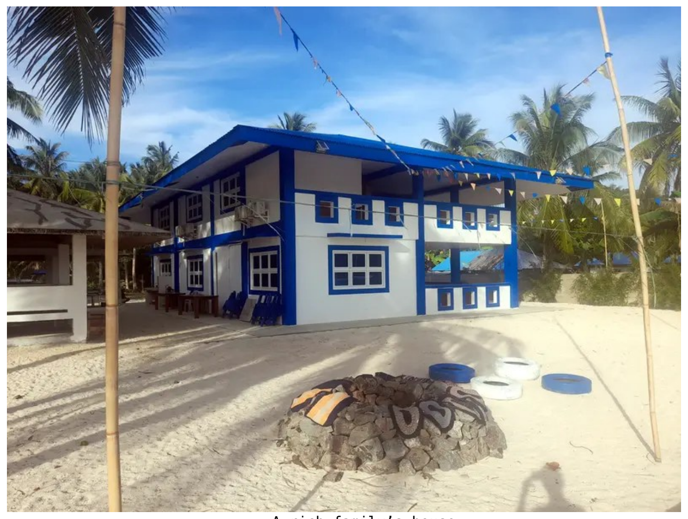
A rich family's house