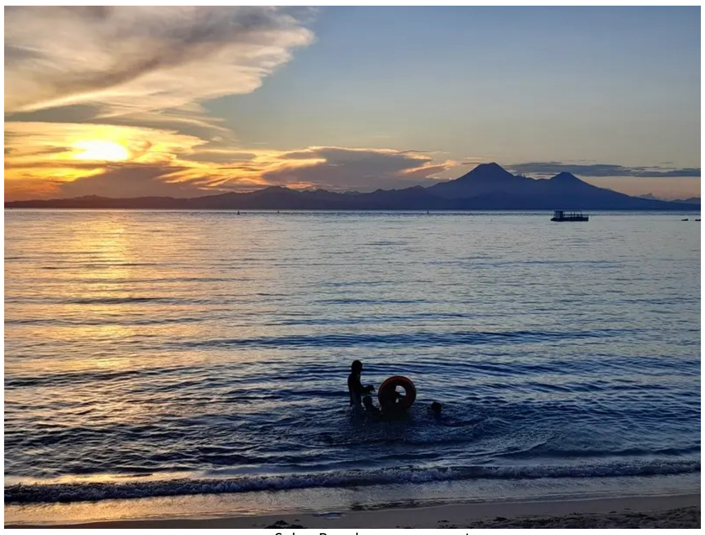
Caba Beach near sunset