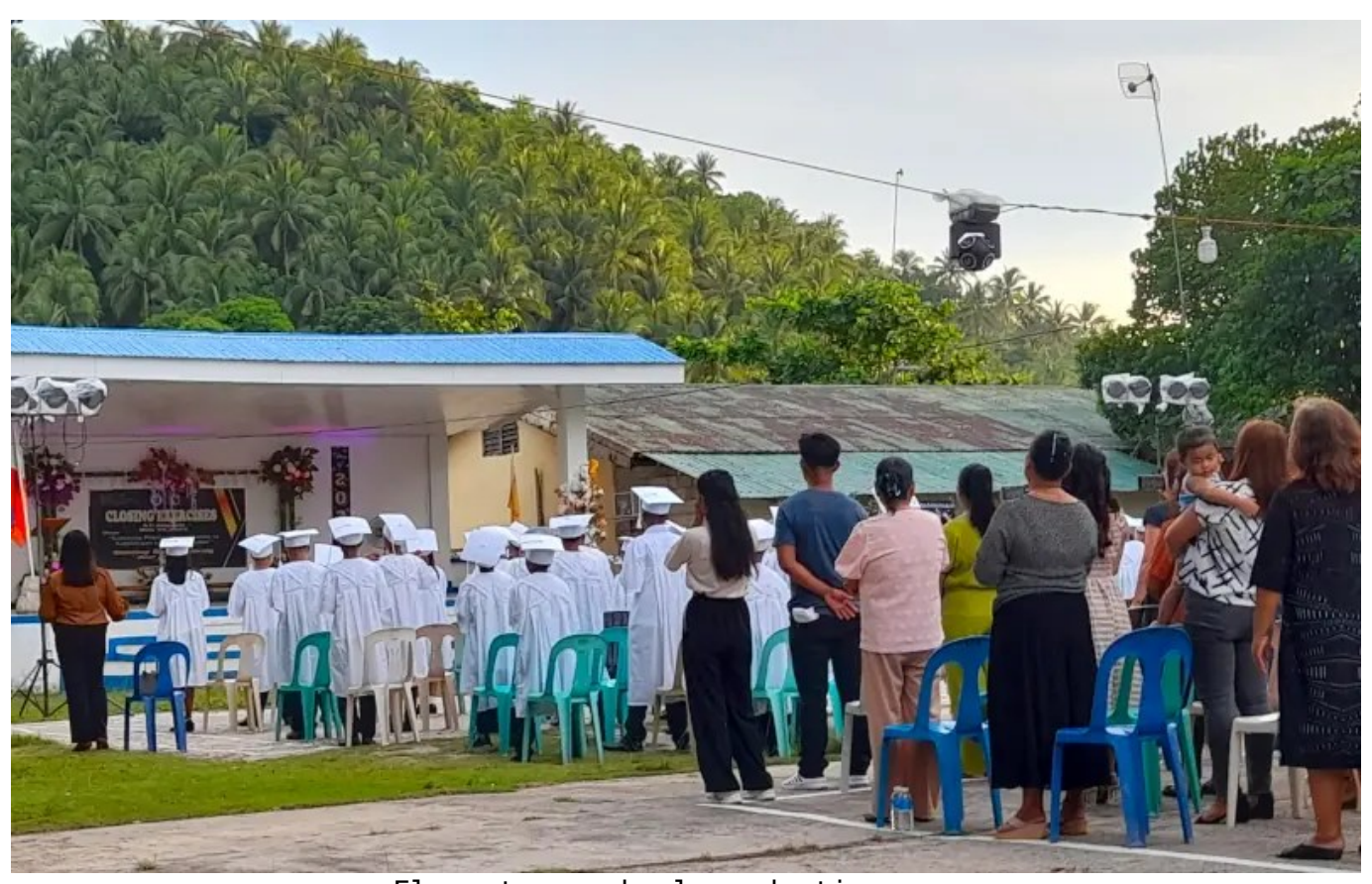
Elementary school graduation ceremony.