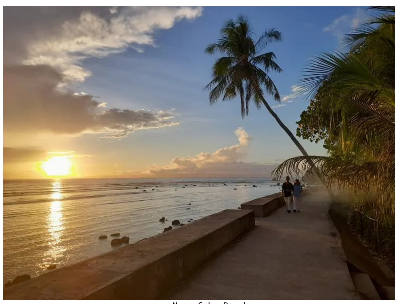
Near Caba Beach