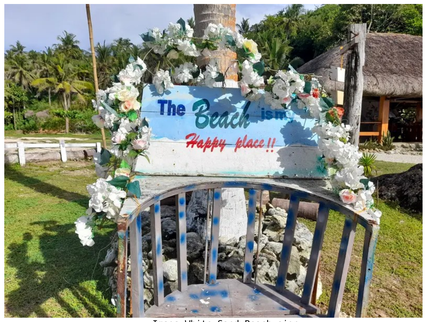
Imaga White Sand Beach sign