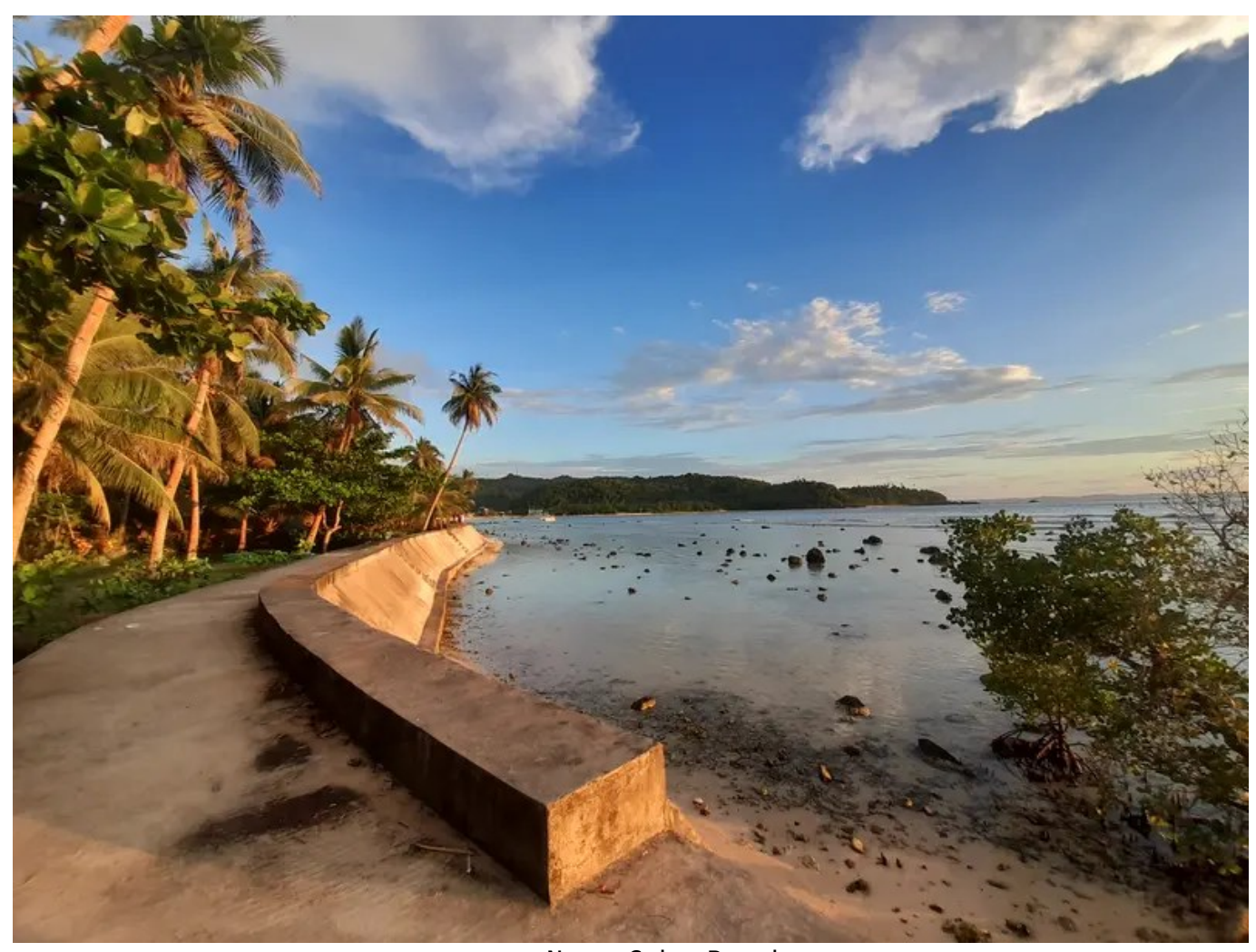
Near Caba Beach