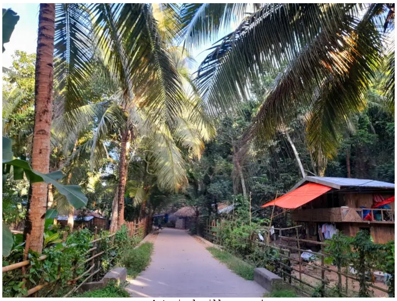
A typical village road.