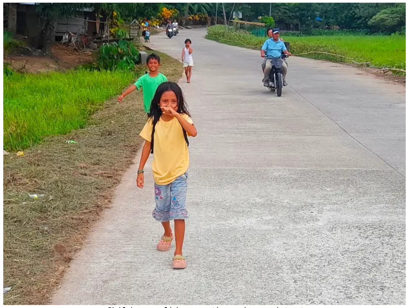
Children walking on the main road to town.