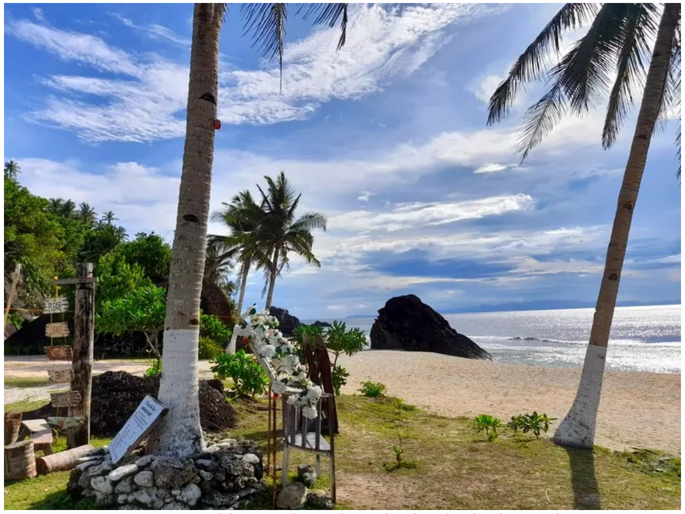
Imaga White Sand Beach rocks in the background.