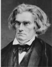
Portrait of Calhoun, c. 1845