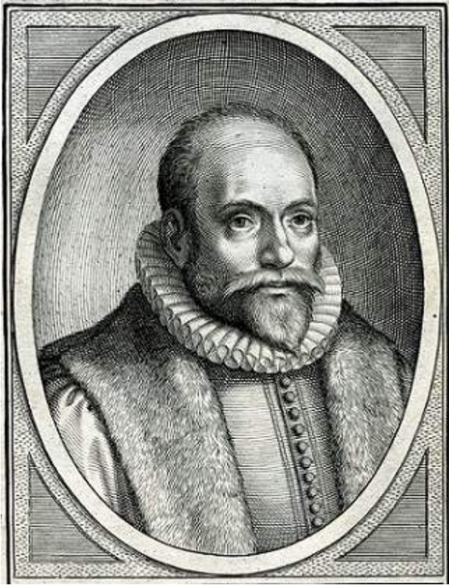
James (Jacob) Arminius

As the doctrines of free grace were in the ascendancy at the time, his teachings on free will were bound to arouse controversy and bring him into conflict with the ecclesiastical authorities. This was a dangerous activity, as heresy could be a capital offence. Perhaps because of this Arminius was difficult to pin down. His teachings could be very ambiguous and sophisticated. In 1605, for example, the Synod set nine simple questions for Arminius to answer in an attempt to clarify his position. He responded with nine opposite questions and employed scholarly and philosophical devices to avoid giving simple, straight answers. The first question was, "Which is first, Election, or Faith Truly Foreseen, so that God elected his people according to faith foreseen?" Arminius did not—perhaps dared not—give a straight answer. And so the controversy rumbled on even until after his death in 1609.