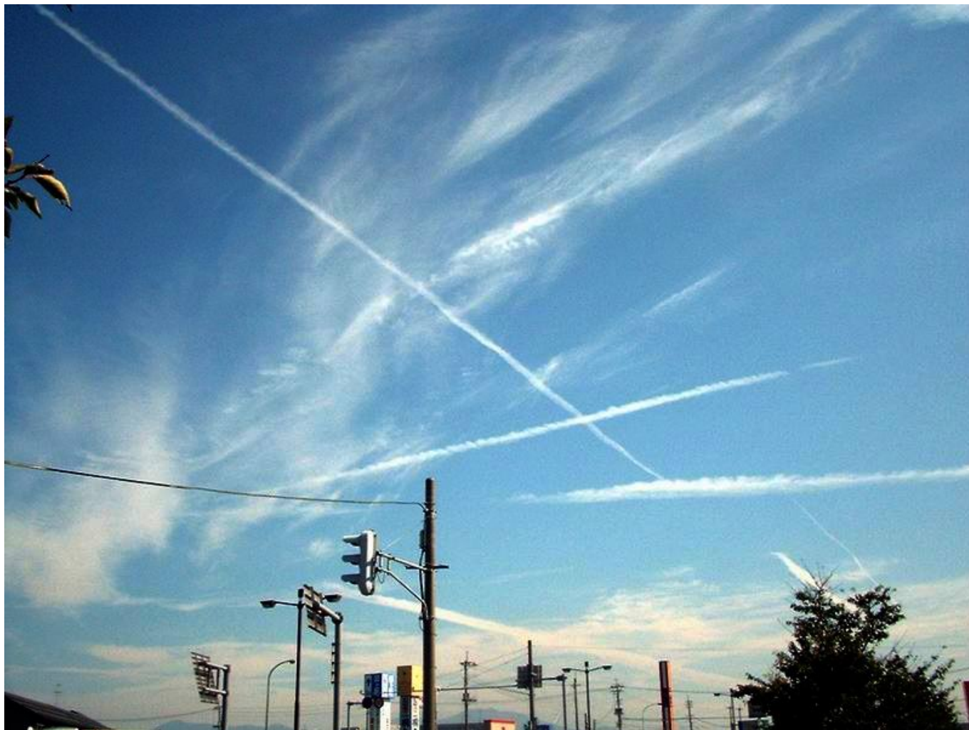
Chemtrails in Japan.