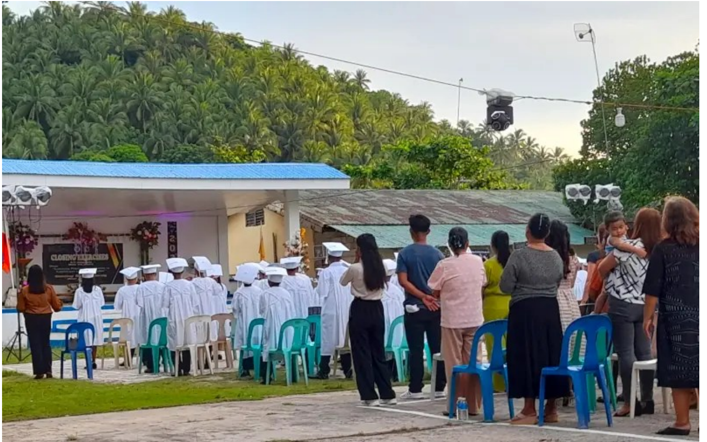
Elementary school graduation ceremony.