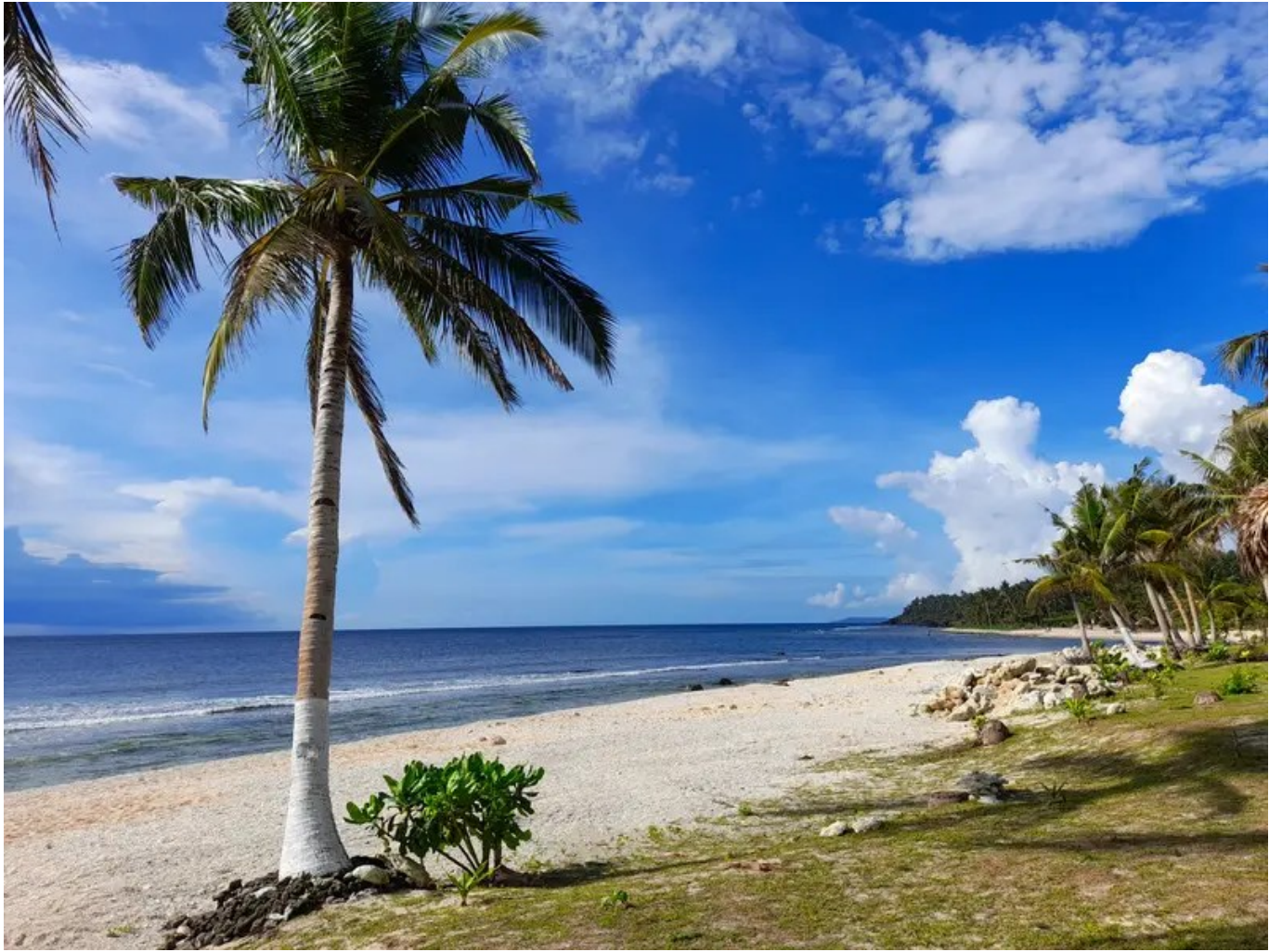
Image White Sand Beach