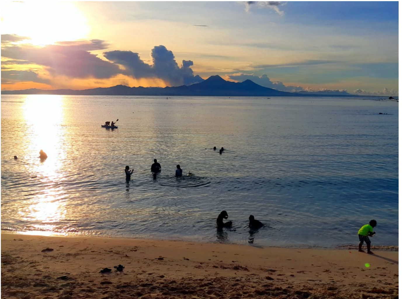
Caba Beach near sunset