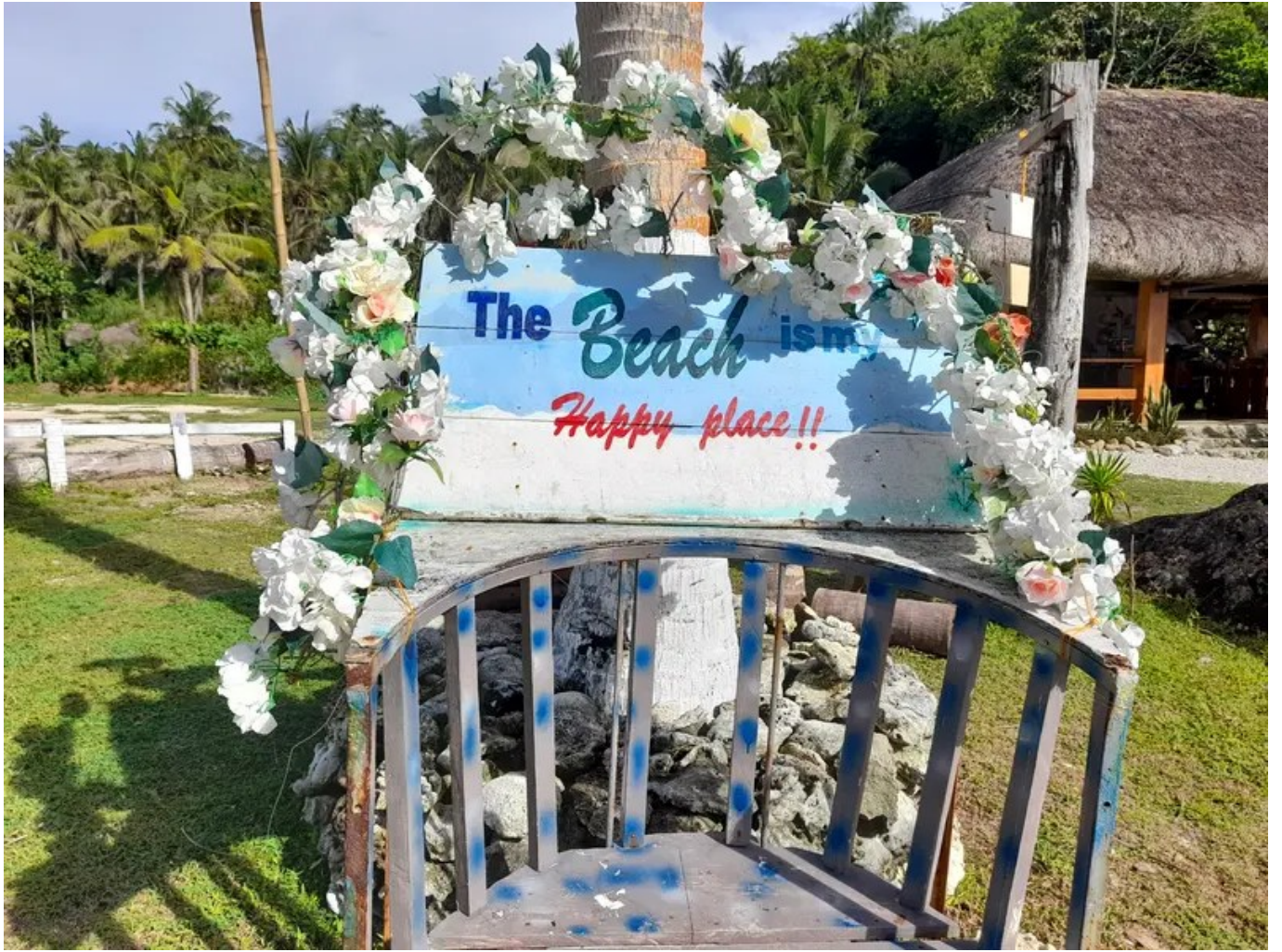
Imaga White Sand Beach sign