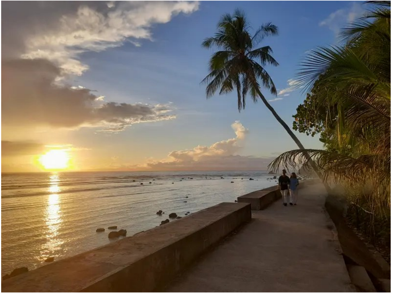
Near Caba Beach