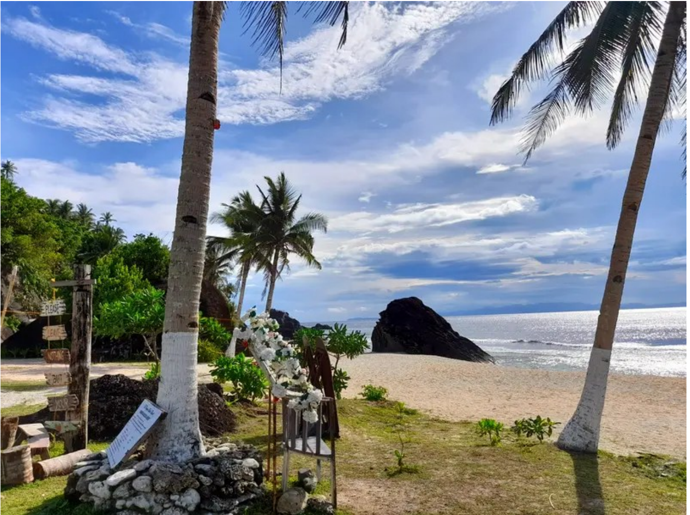
Imaga White Sand Beach rocks in the background.