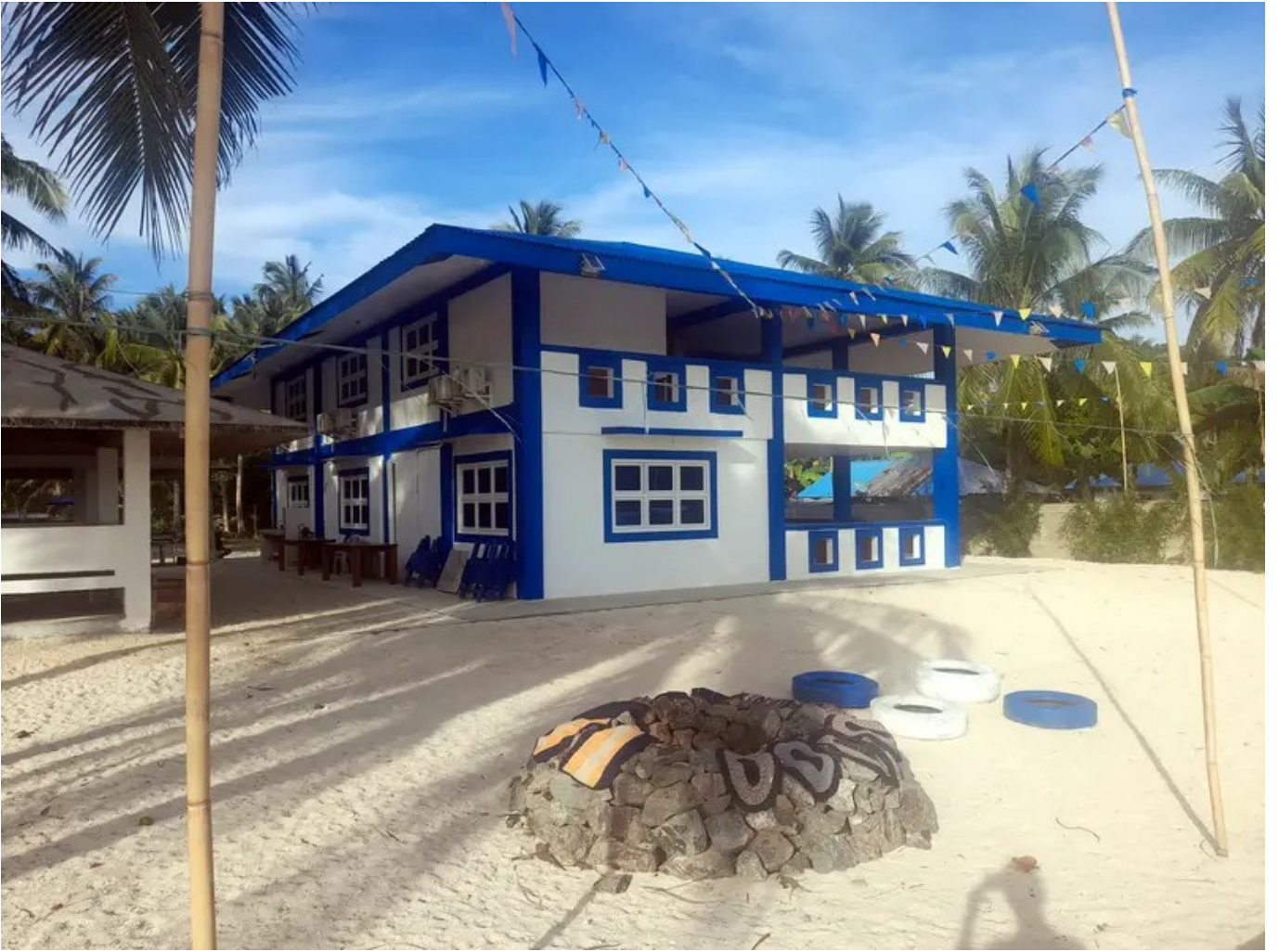
A rich family's house