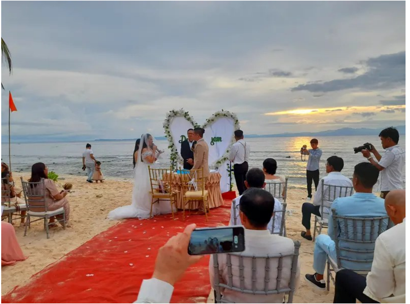
Wedding at Imaga White Sand Beach