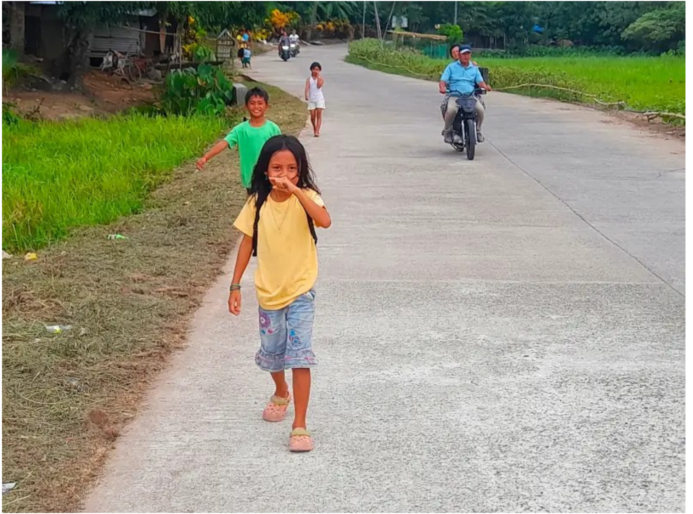
Children walking on the main road to town.