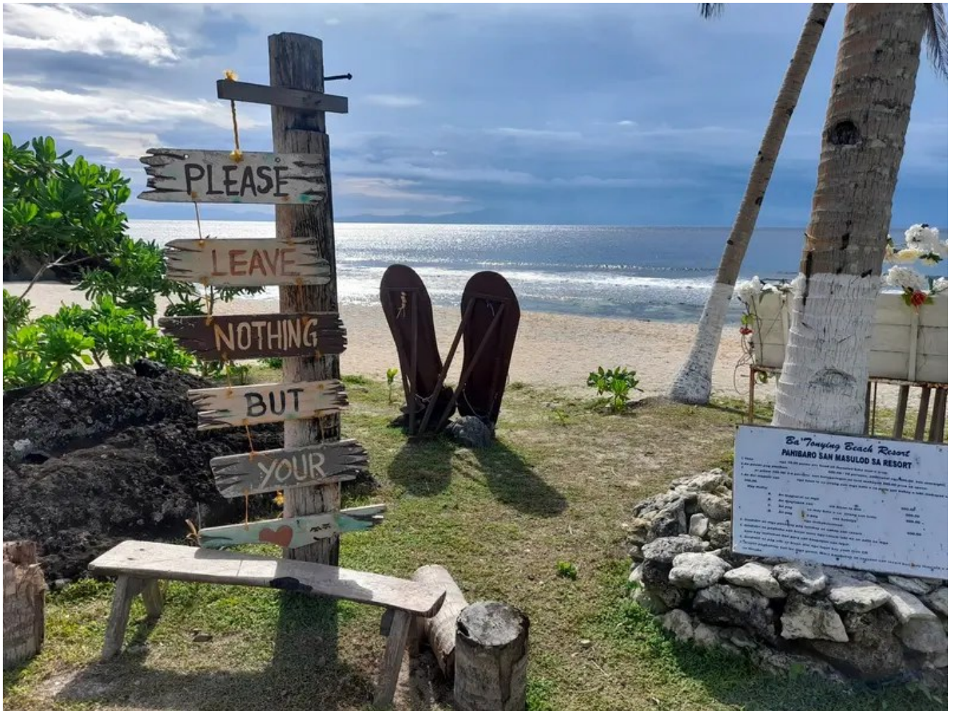
Imaga White Sand Beach sign.