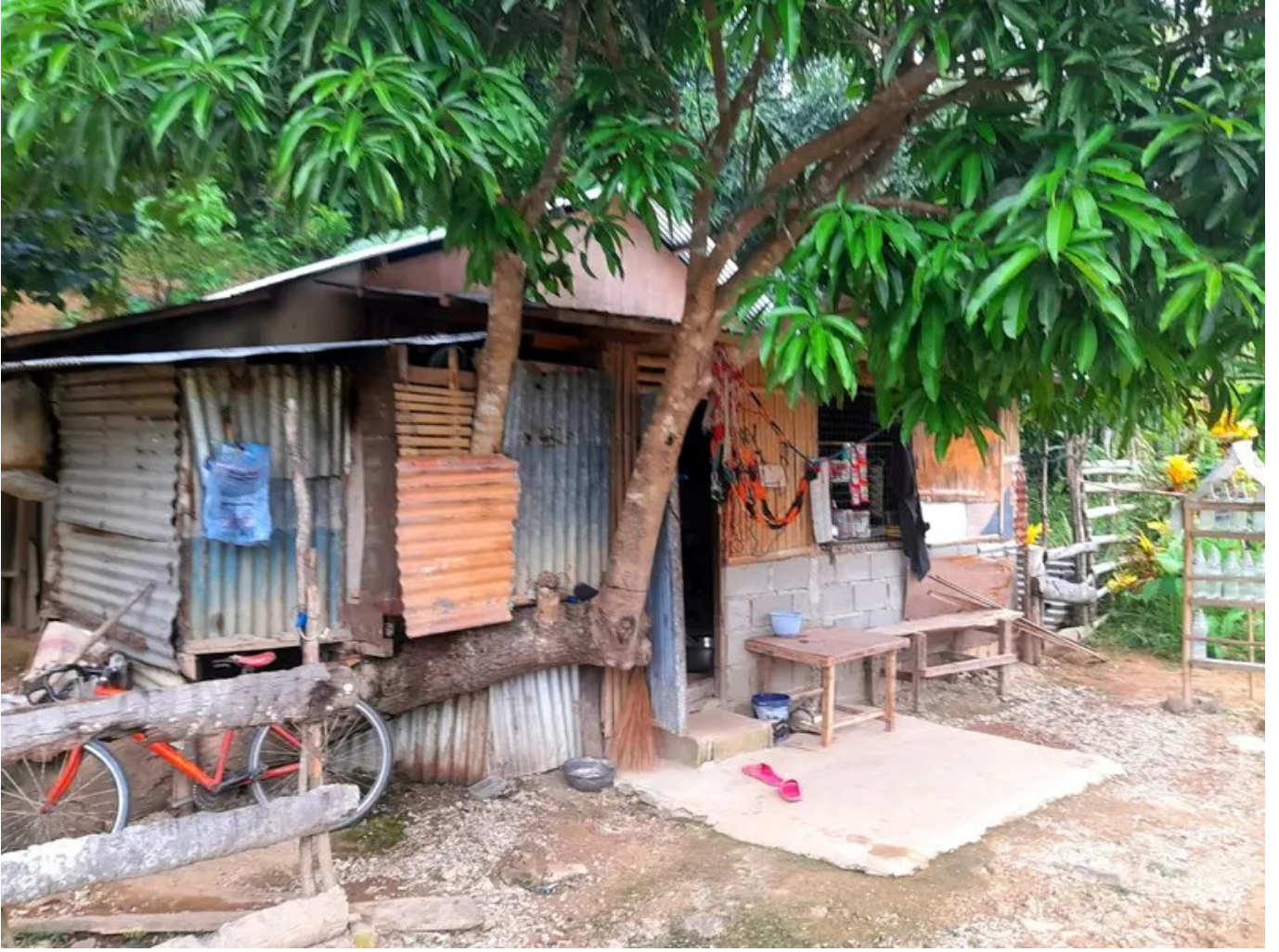
A poor family's house