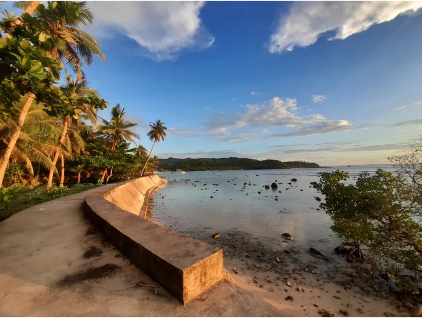
Near Caba Beach