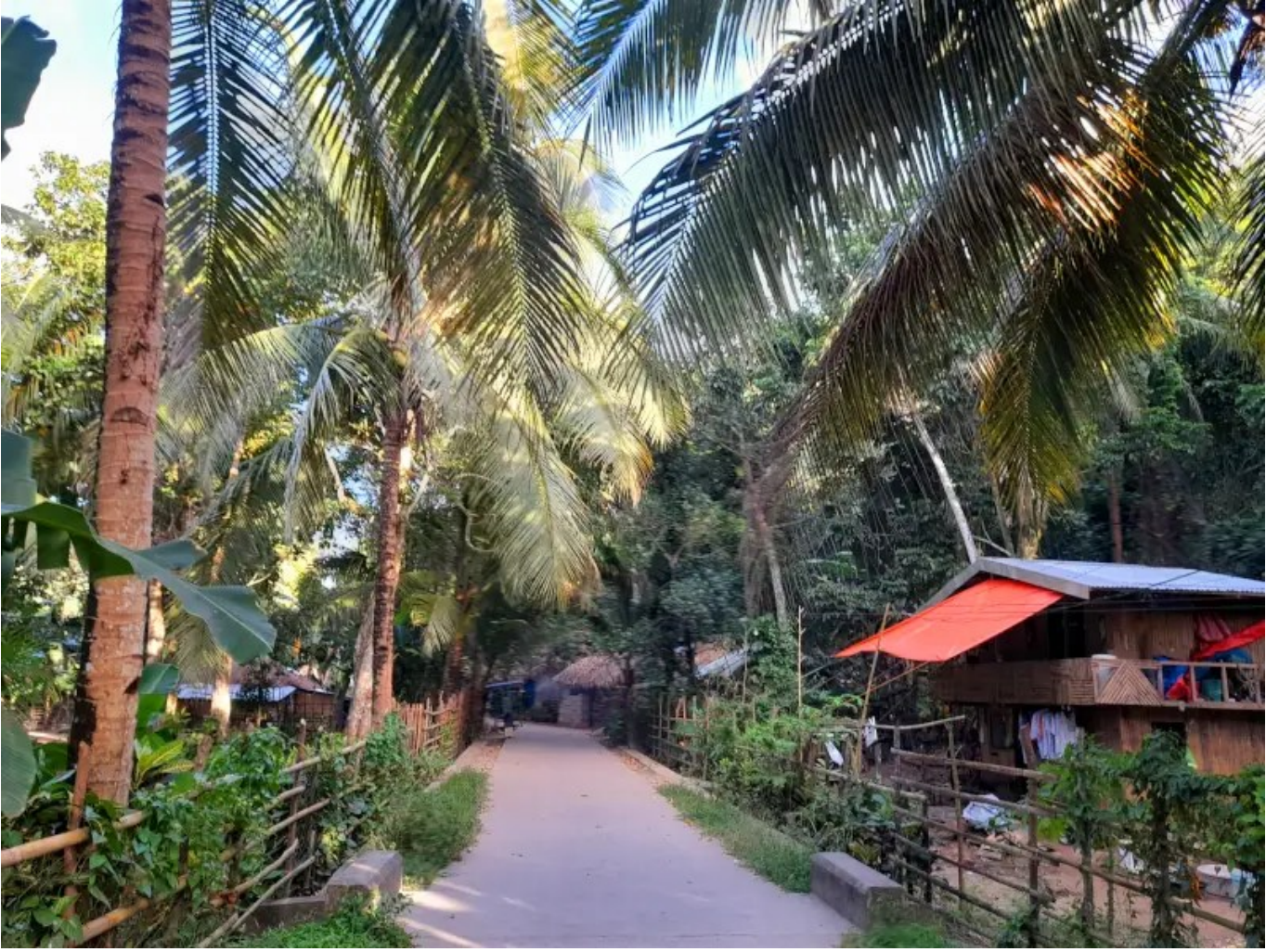
A typical village road.