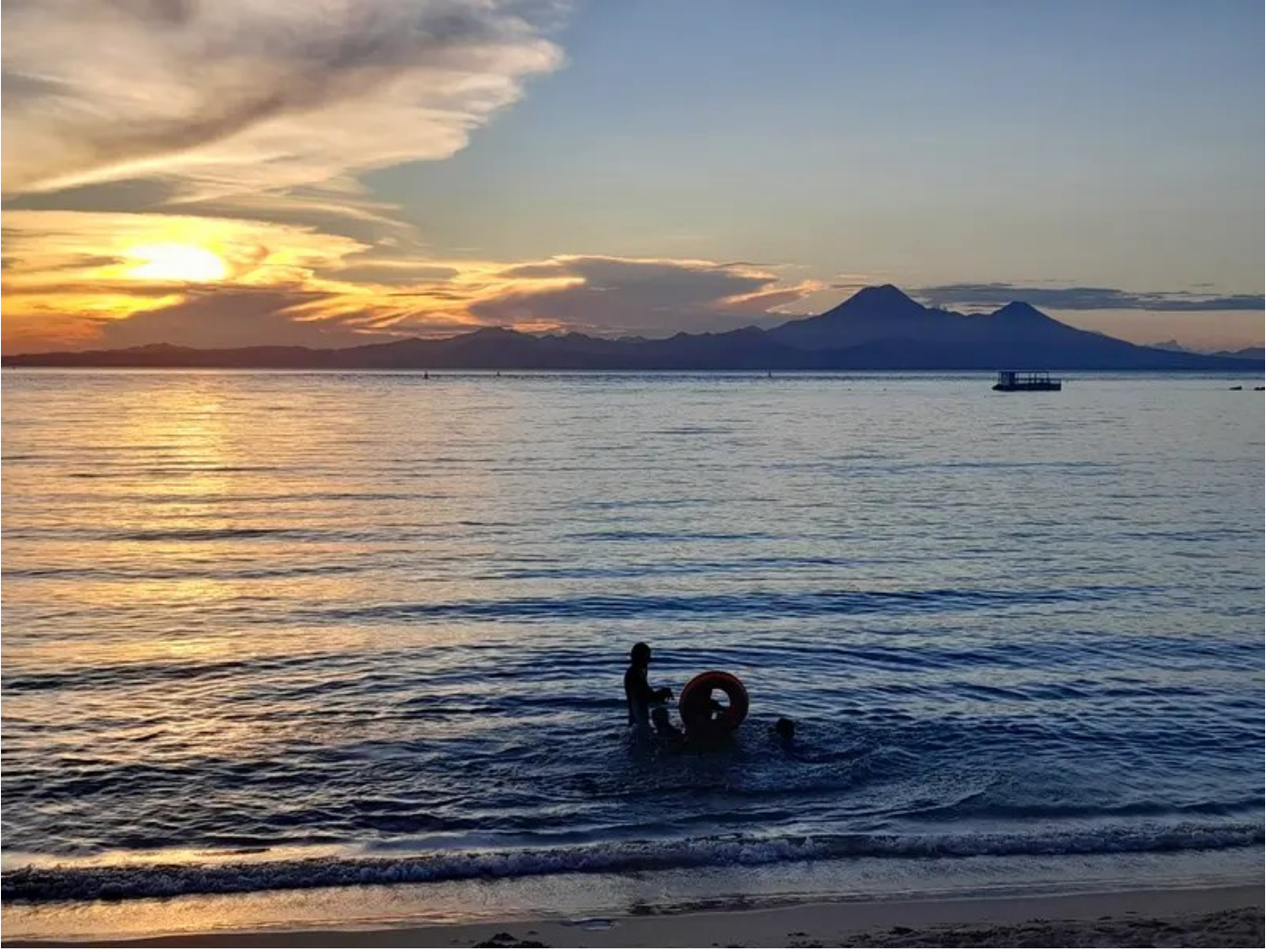
Caba Beach near sunset