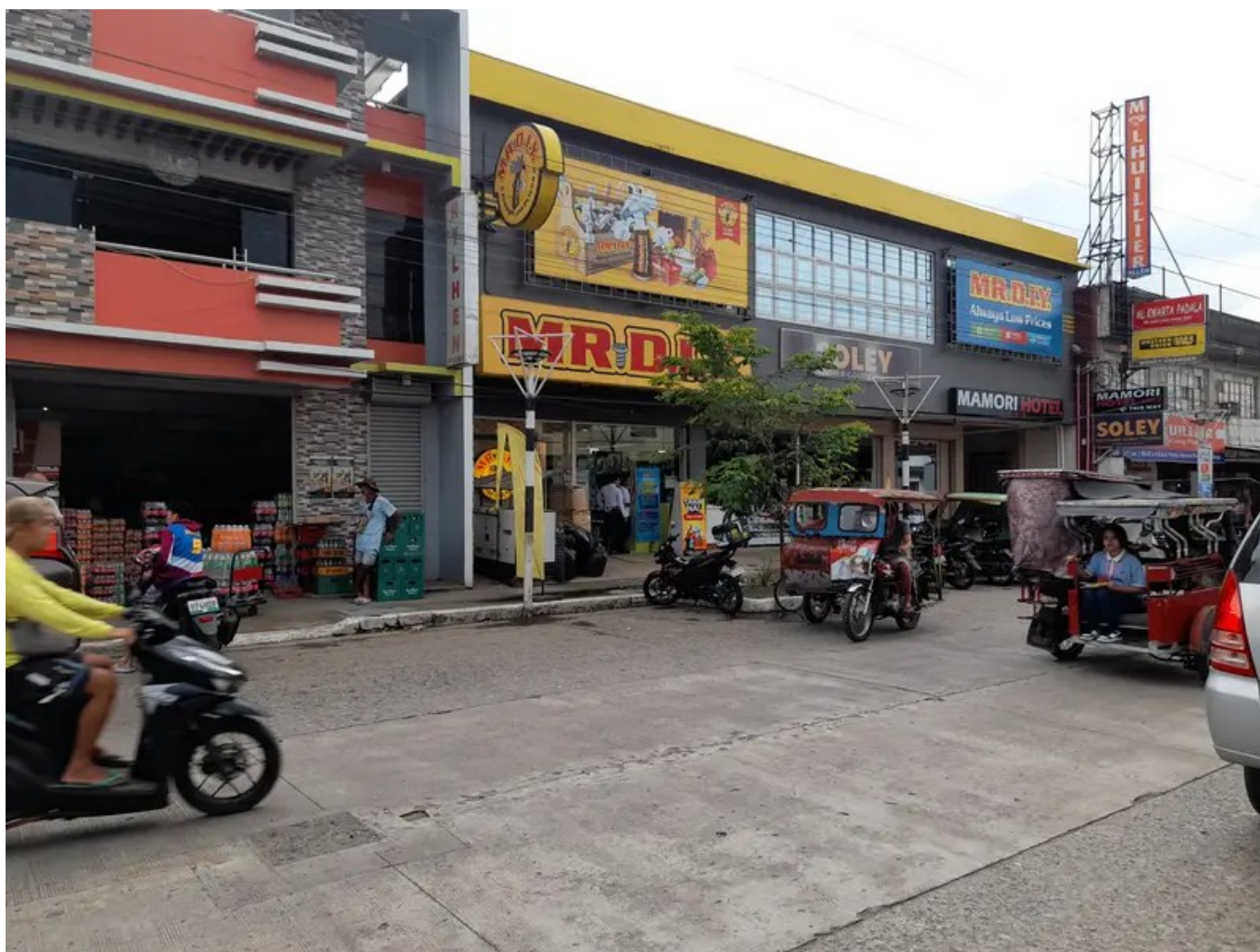
The main shopping street in downtown Allen.

One of the most inconvenient things about life in the Philippines is frequent power outages. I don't know about Manila or other large cities, but where I live in the province of Northern Samar, power outages are frequent. They can occur anytime, and when they do, we also have no WIFI to connect to the Internet. I keep my laptop charged so I can still do some work on articles even without an Internet connection.