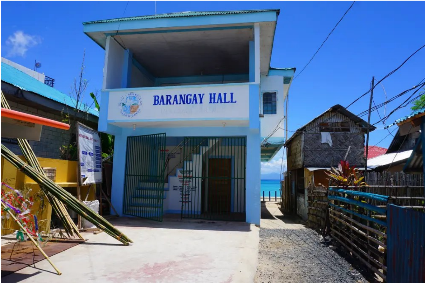
Our Barangay hall. Villages in the Philippines are called barangays. The person who is elected to watch over the barangay is called the barangay captain.