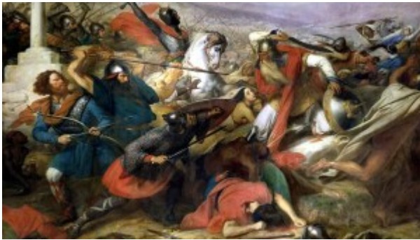
Revelation 9:1-11. The Fifth Trumpet is all about Mohammad and the rise of Islam and the Muslim invaders.