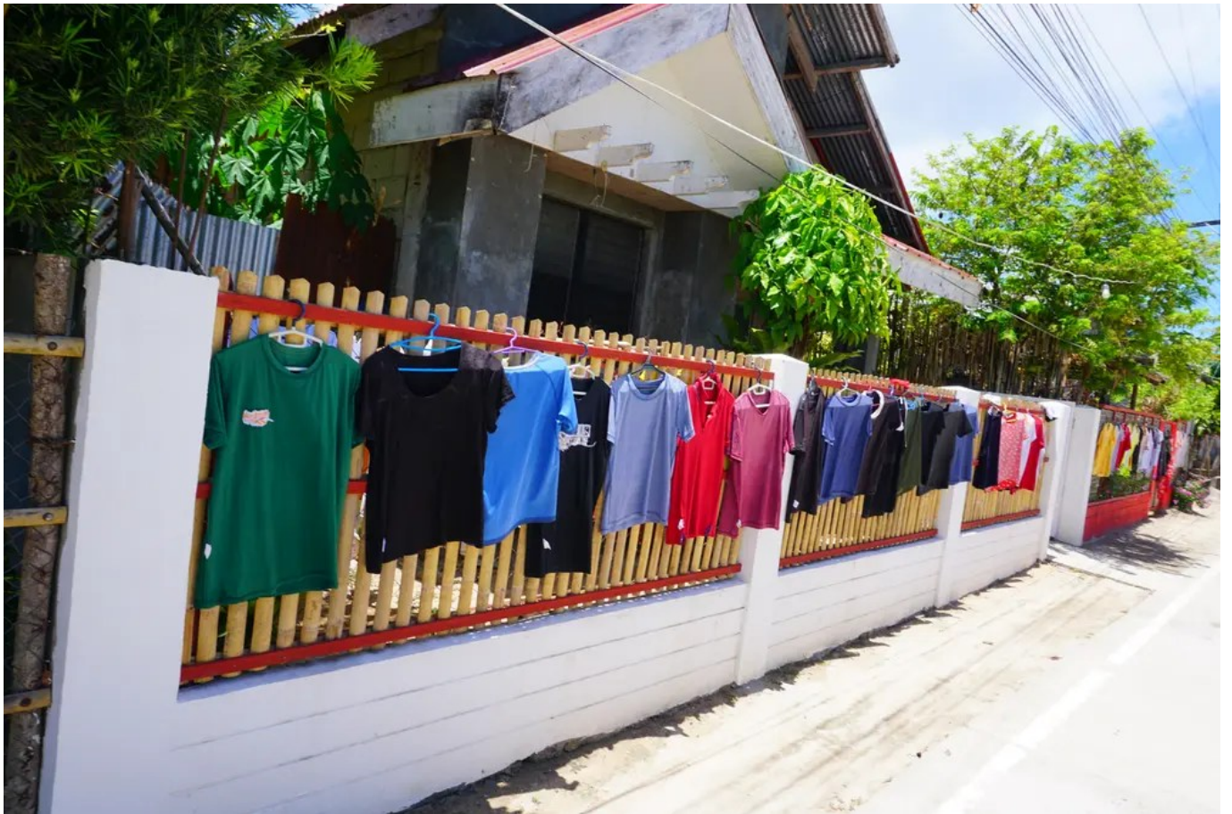
Drying clothes on fence.