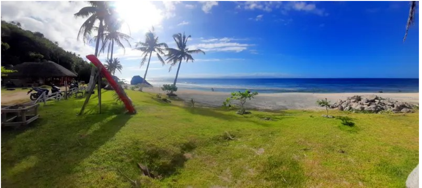
Imaga beach in Northern Samar.

Beautiful scenery like this is abundant. This one is Mt. Bulusan across the San Bernadino Strait, a view from Caba Beach, Cabacungan, the city of Allen in Northern Samar.