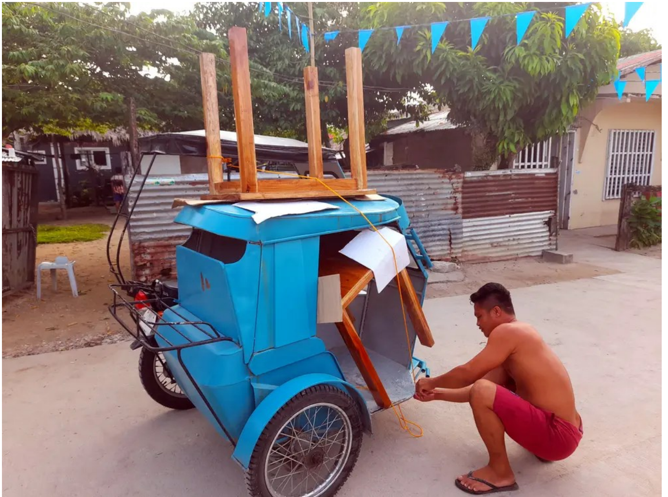
This is an example of how Filipinos use a sidecar to haul things. Our neighbor Jason is using it to carry tables to another location.