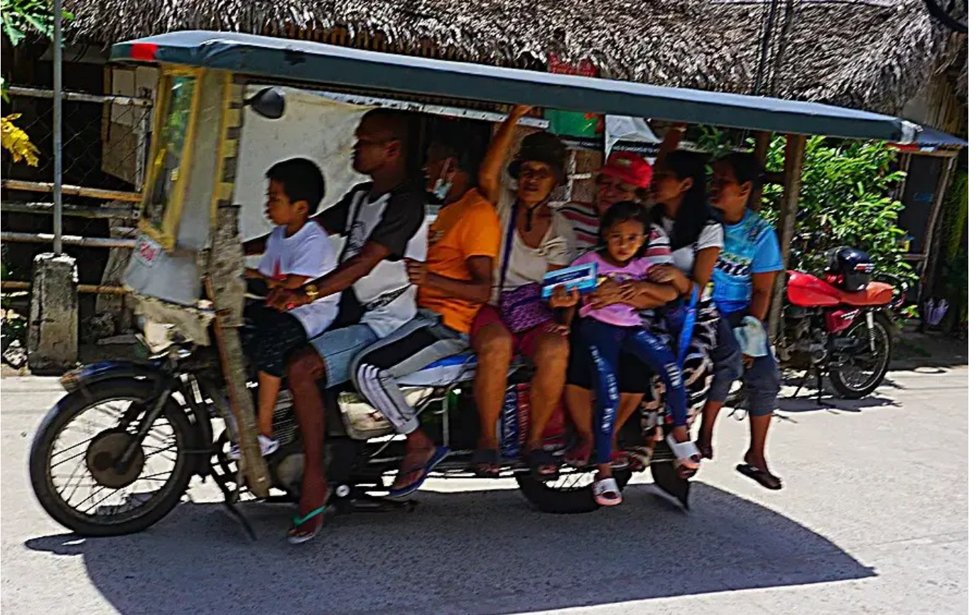
This is a popular public mode of transportation called a Habal-habal. This one is maxed out with passengers. We rode on them many times.