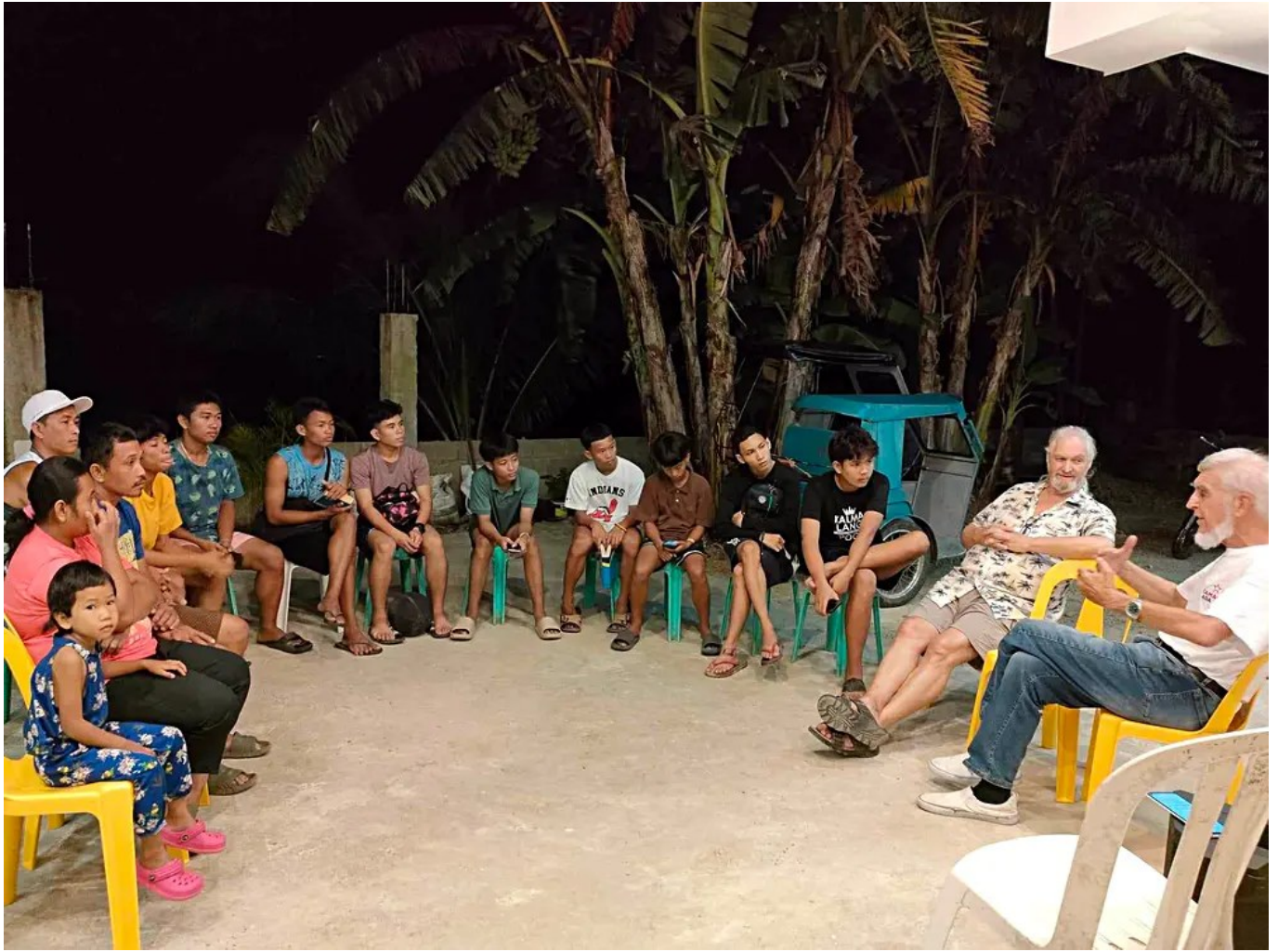
Teen Bible study. I am sharing my testimony how I started to share the Gospel a few weeks after I got saved in 1971 to my fellow Airmen while stationed at McClellan AFB in Sacramento California.