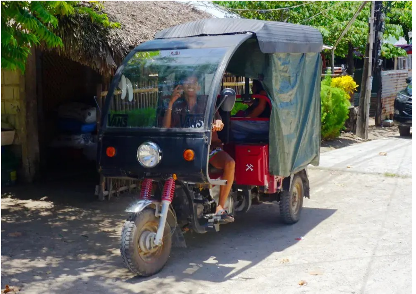
This is another type of tricycle with the front wheel in the center. I hear it's much easier to steer than one with a sidecar like ours.