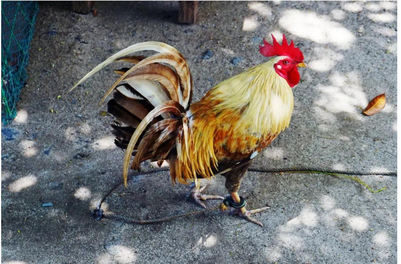
This rooster is right outside our house next door. They are raised for cock fighting. You see one of its legs is tied to a rope which limits how far he can walk.