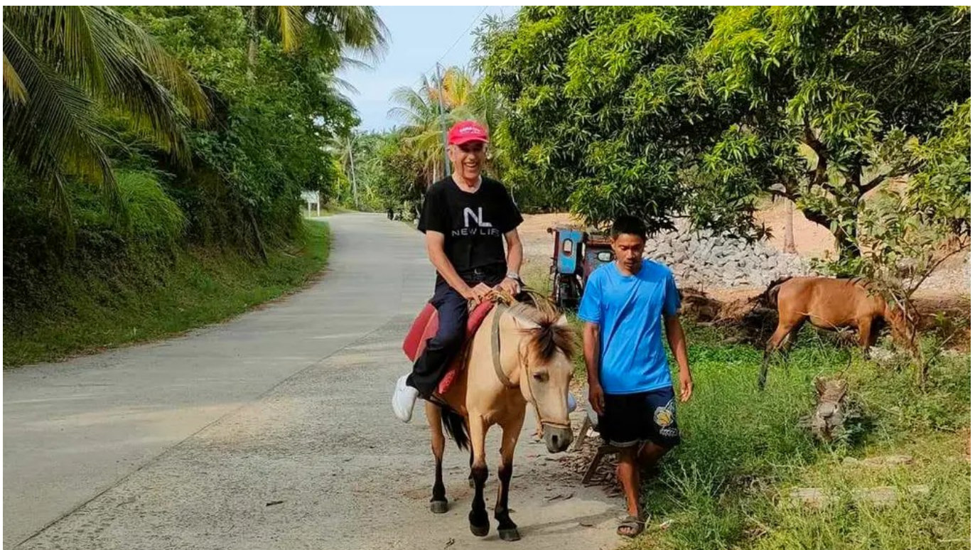
Me on a horse. Besides the two houses I see in the area, there are goats, water buffalo, chickens, ducks, and lots of stay dogs and cats.