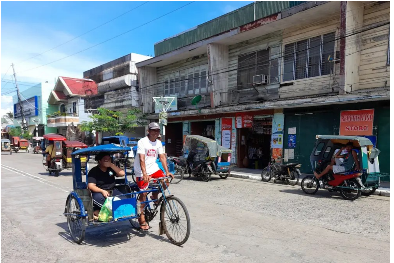
Human powered tricycle taxi in downtown Allen.