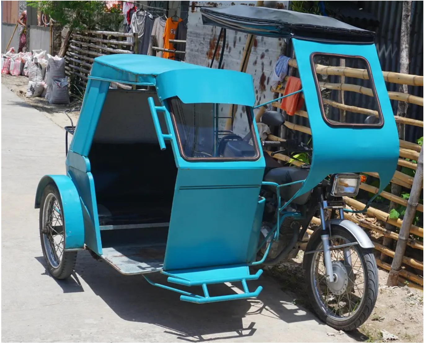
Another view of the trike. Our gasoline costs monthly are now only 1/5 of what it was in Guam.