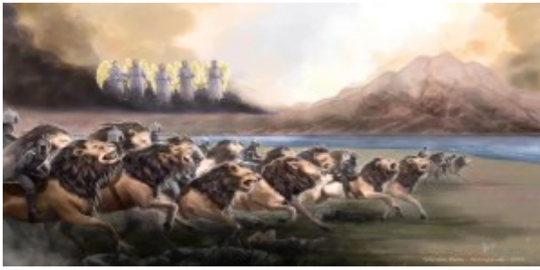
The Turco-Muslims, A.D. 1063