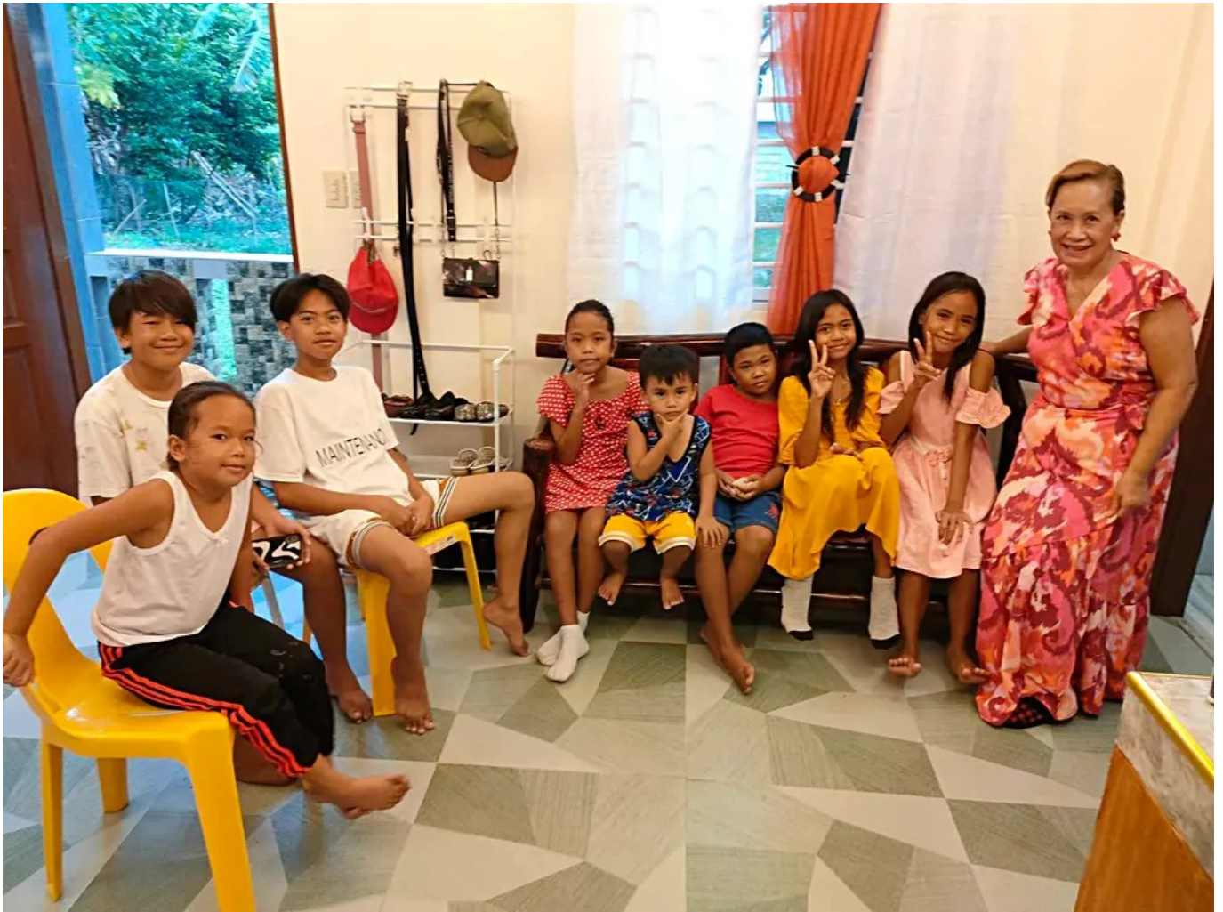
Another children's Bible study.