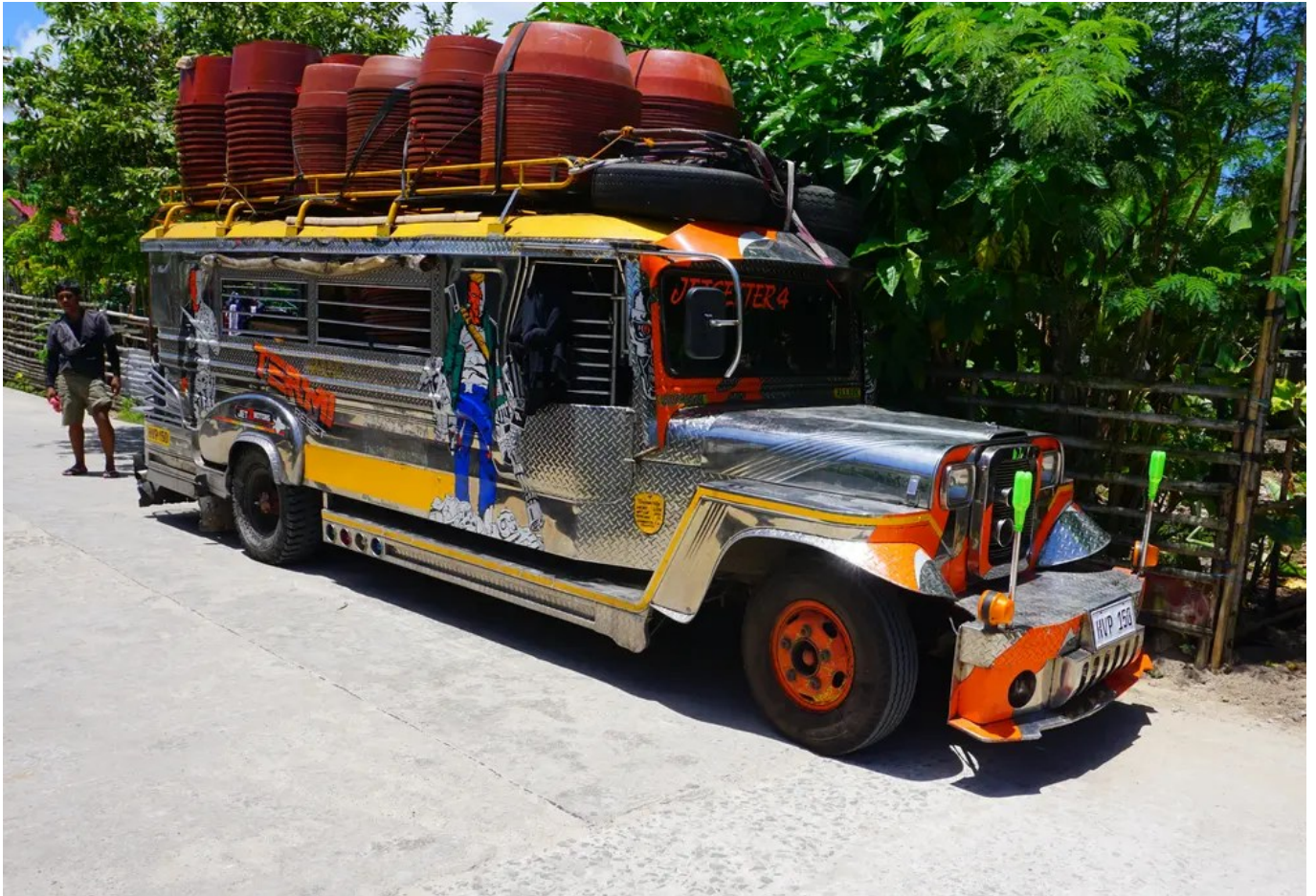
This is a public transportation vehicle called a Jeepney. This one is privately used. I never rode on one because they're not used here. I saw them in Manila.