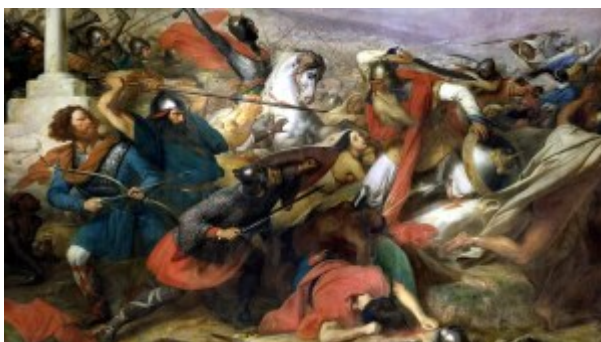
Revelation 9:1-11. The Fifth Trumpet is all about Mohammad and the rise of