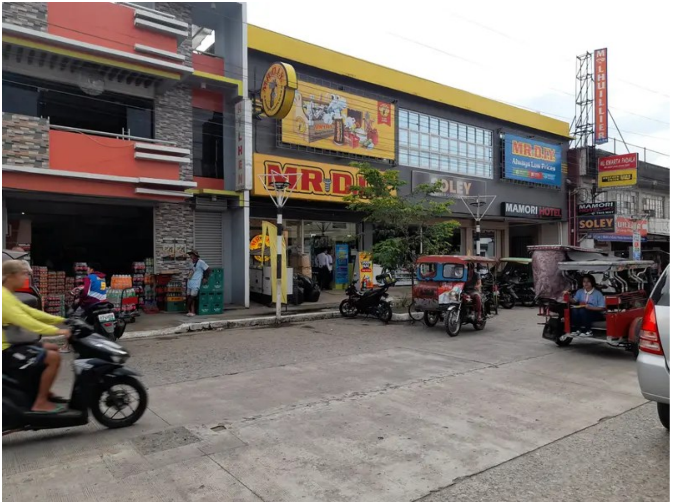
The main shopping street in downtown Allen.