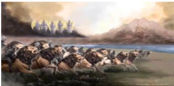
The Turco-Muslims, A.D. 1063