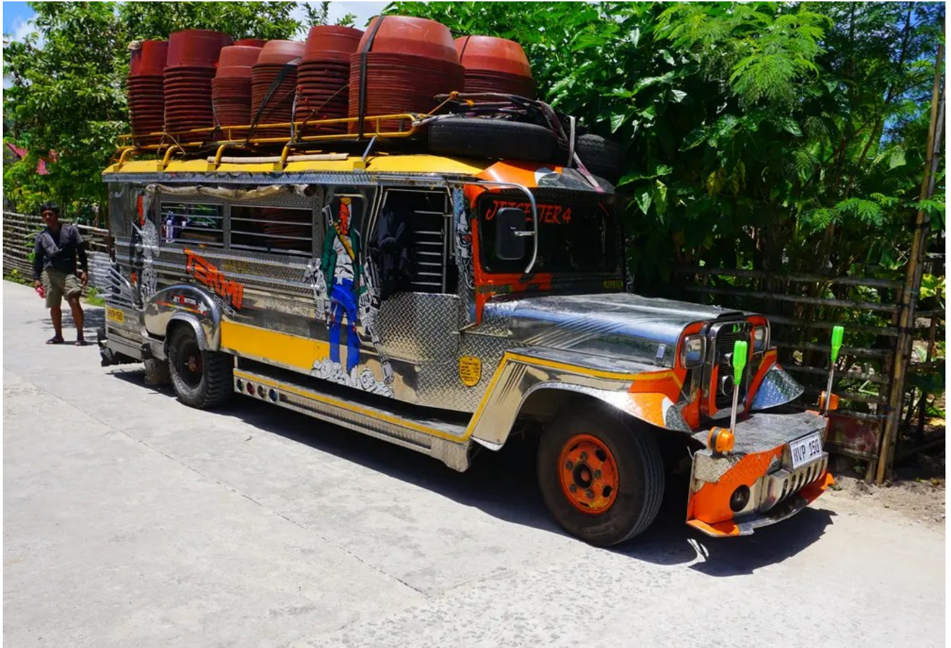
This is a public transportation vehicle called a Jeepney. This one is privately used. I never rode on one because they're not used here. I saw them in Manila.