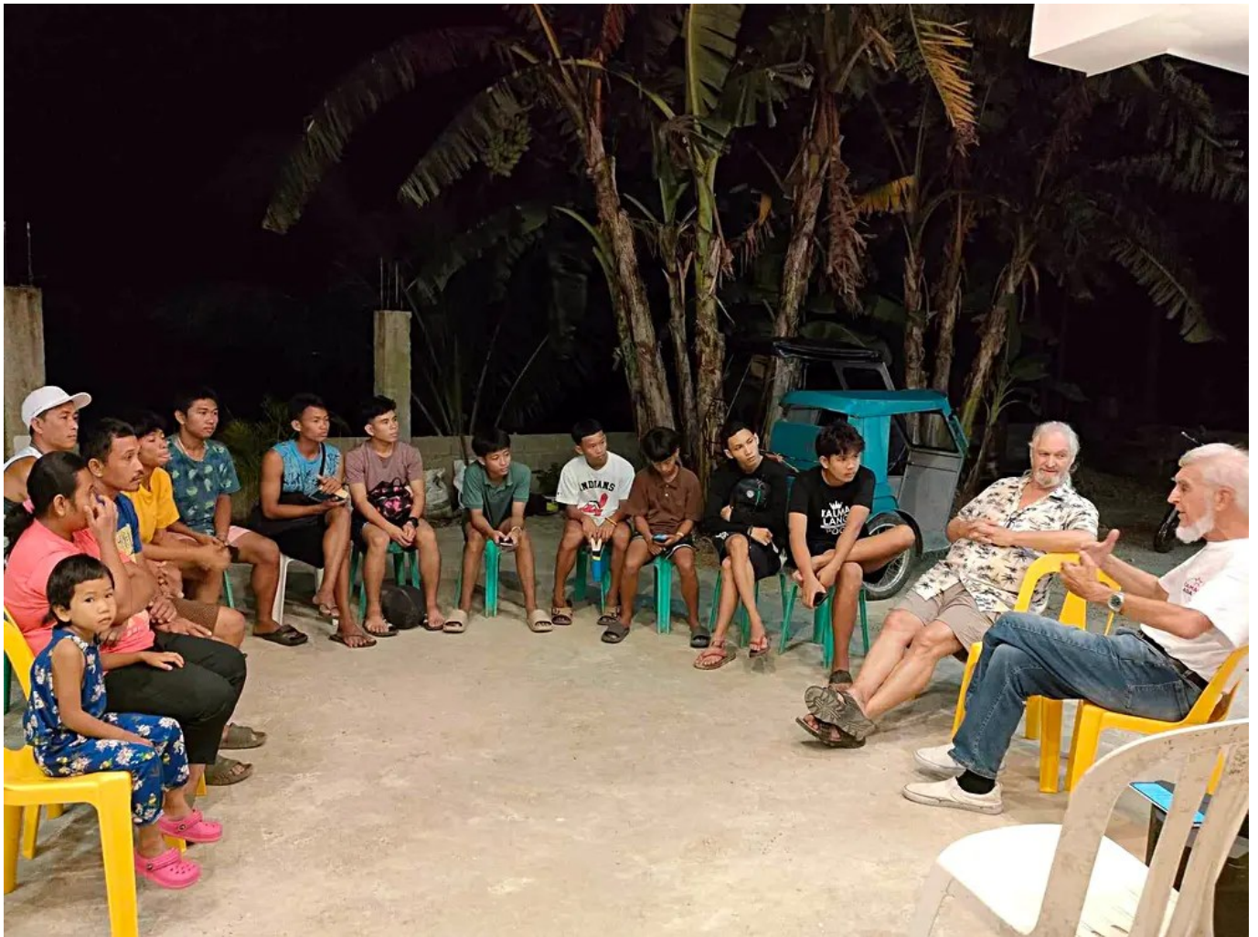
Teen Bible study. I am sharing my testimony how I started to share the Gospel a few weeks after I got saved in 1971 to my fellow Airmen while stationed at McClellan AFB in Sacramento California.