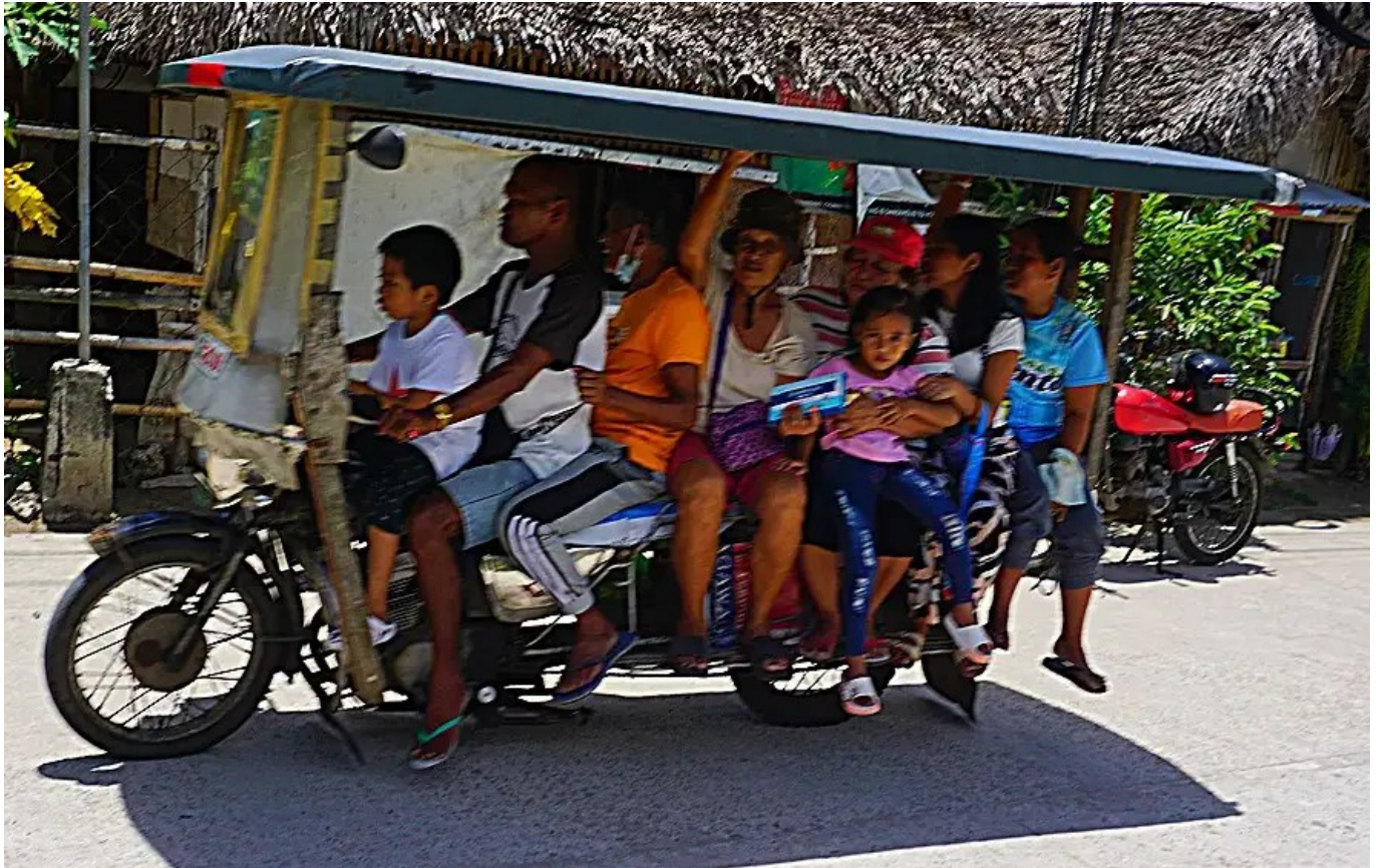
This is a popular public mode of transportation called a Habal-habal. This one is maxed out with passengers. We rode on them many times.