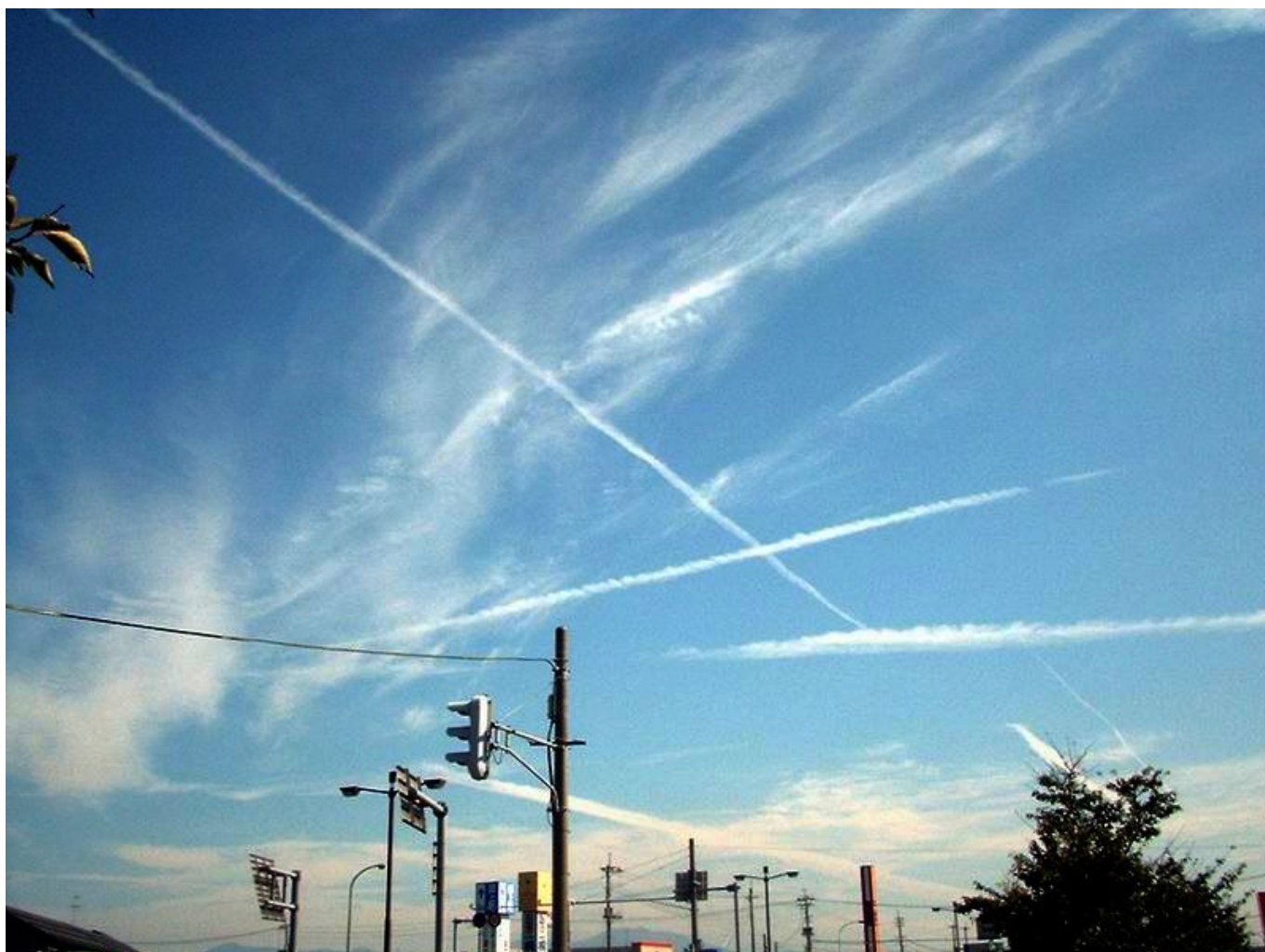
Chemtrails in Japan.

I've known about chemtrails from around 1999. Here's an article I posted in 2002: