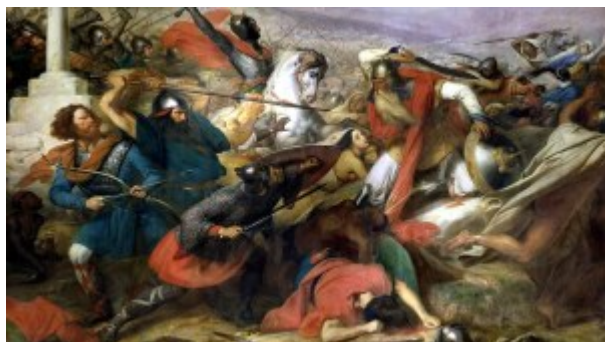
Revelation 9:1-11. The Fifth Trumpet is all about Mohammad and the rise of Islam and the Muslim invaders.