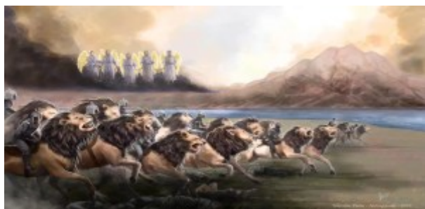
The Turco-Muslims, A.D. 1063