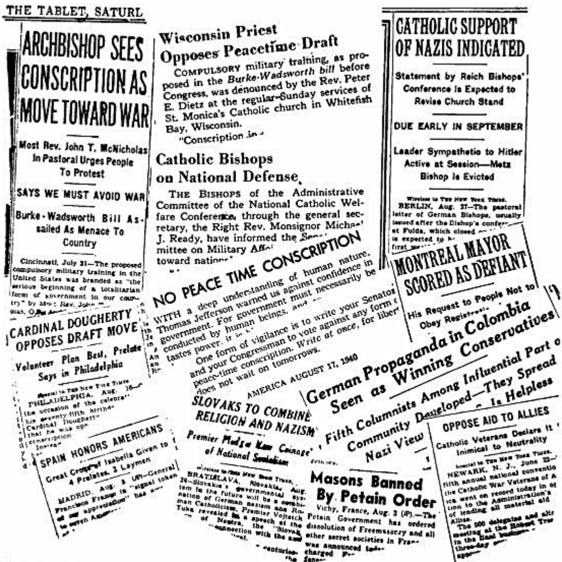
Samples of newspaper headlines during the summer of 1940 showing American hierarchy's help to the Axis by opposing Lend-Lease and U. S. preparation for National Defense.