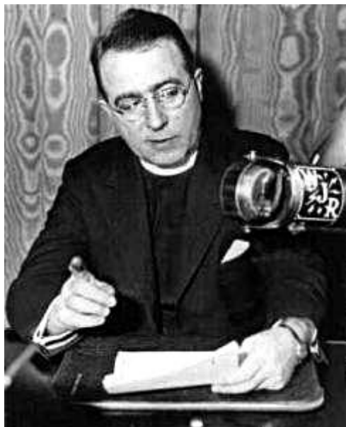
Rev. Charles E. Coughlin, still Pro-Fascist, Anti- British, Anti-Semitic.