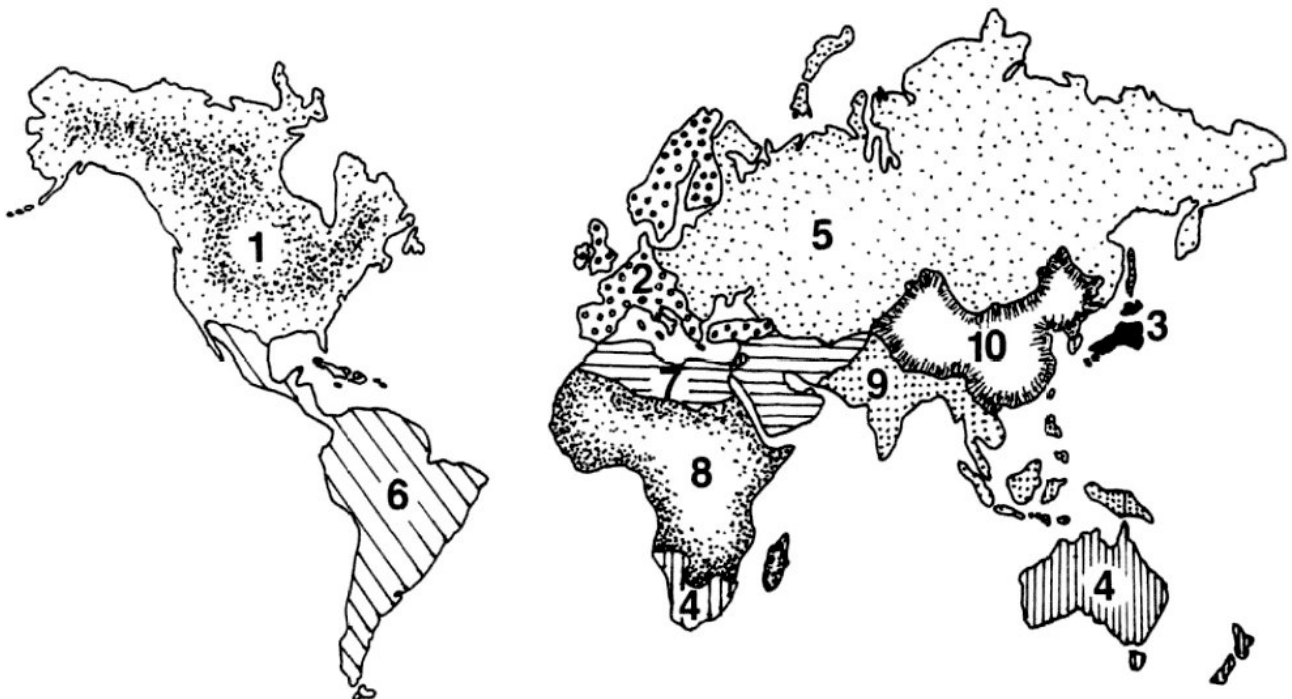
Ten Kingdoms . . . from: THE CLUB OF ROME

I believe these 10 regions may very well be the 10 horns / crowns of the books of Daniel and Revelation!