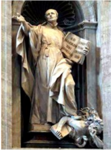
Statue in St. Peter's Basilica of Ignatius of Loyola, the founder of the Jesuit Order. His foot is on a Protestant Christian holding a Bible.