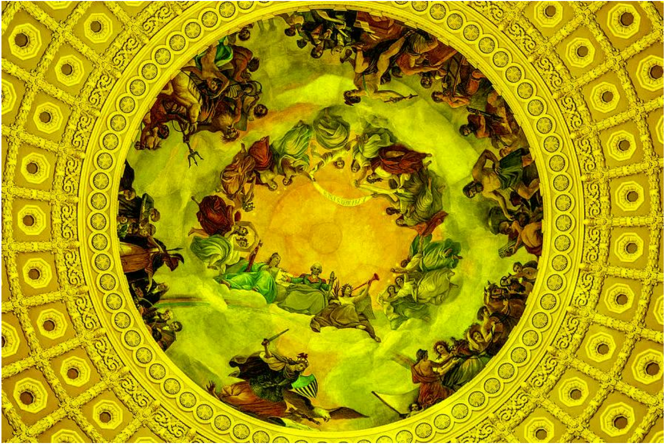
The Apotheosis of Washington is the fresco painted by Greek-Italian artist Constantino Brumidi in 1865 and visible through the oculus of the dome in the rotunda of the United States Capitol Building in Washington, D.C.