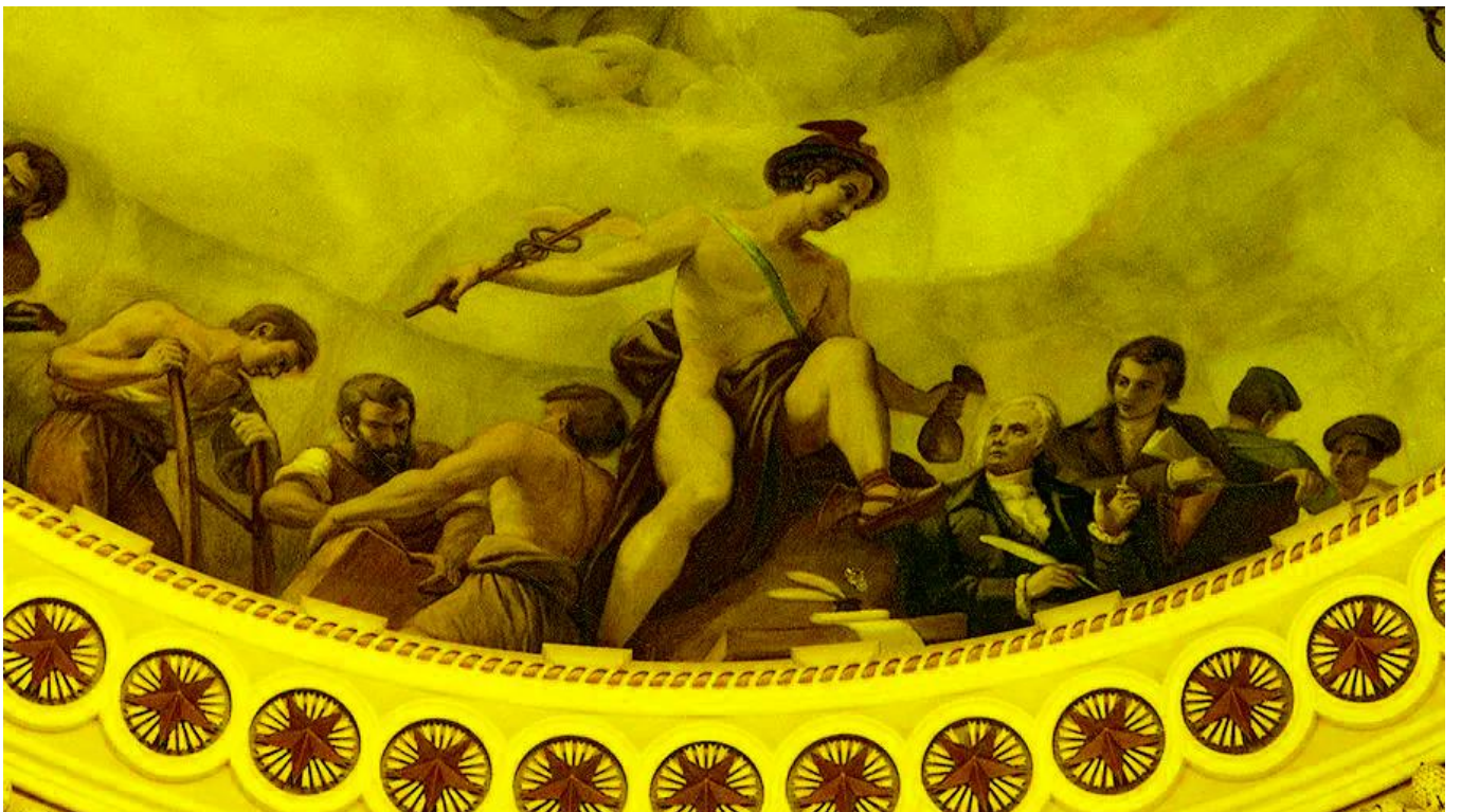
(From part of the fresco.) A grant from the trickster Mercury, “the