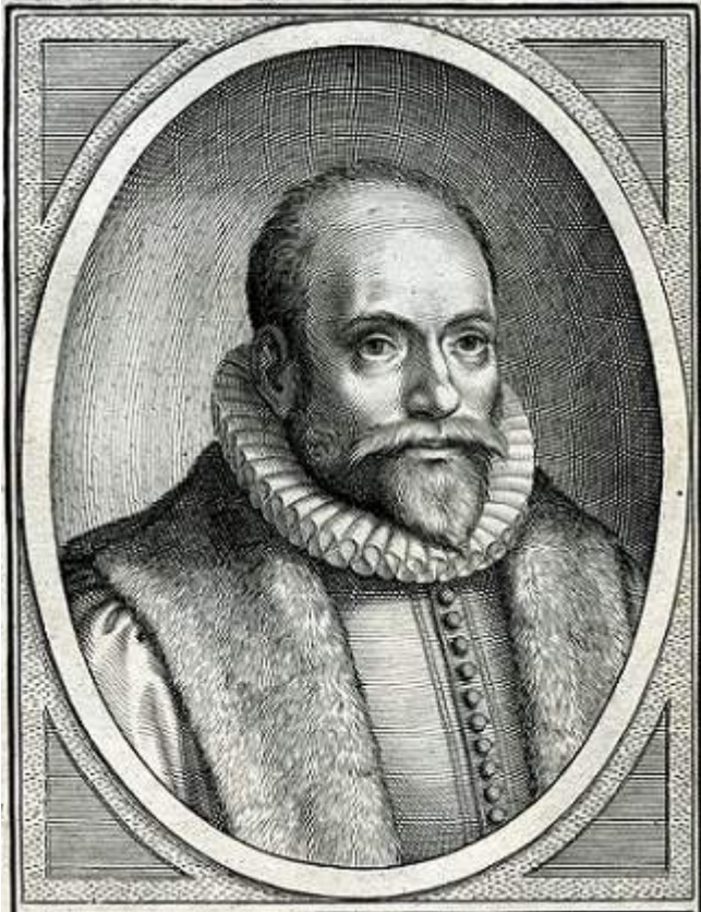
James (Jacob) Arminius

As the doctrines of free grace were in the ascendancy at the time, his teachings on free will were bound to arouse controversy and bring him into conflict with the ecclesiastical authorities. This was a dangerous activity, as heresy could be a capital offence. Perhaps because of this Arminius was difficult to pin down. His teachings could be very ambiguous and sophisticated. In 1605, for example, the Synod set nine simple questions for Arminius to answer in an attempt to clarify his position. He responded with nine opposite questions and employed scholarly and philosophical devices to avoid giving simple, straight answers. The first question was, "Which is first, Election, or Faith Truly Foreseen, so that God elected his people according to faith foreseen?" Arminius did not—perhaps dared not—give a straight answer. And so the controversy rumbled on even until after his death in 1609.