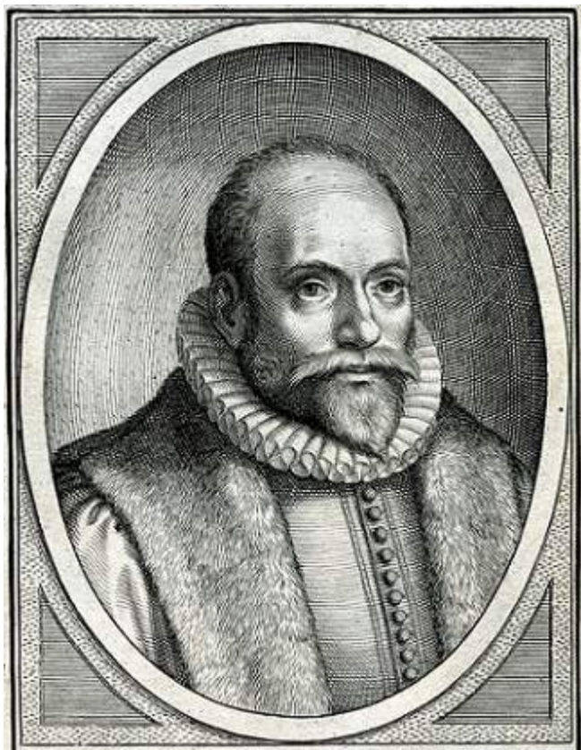
James (Jacob) Arminius

James Arminius (1560-1609) is generally regarded as the founder of the system of Arminianism. He was educated at the new Dutch University at Leyden and then at Geneva under the tutelage of Theodore Beza, Calvin’s well respected follower and successor. Around 1591, after only a year at the Geneva Academy, he began to develop views that were to become diametrically opposed to the doctrines of free and sovereign grace that were taught at Geneva. He departed and continued his education elsewhere. He became a minister in Amsterdam and was later invited to become Professor of Divinity at the University of Leyden. It was from this point that he began propounding his theories with (guarded) vigour.