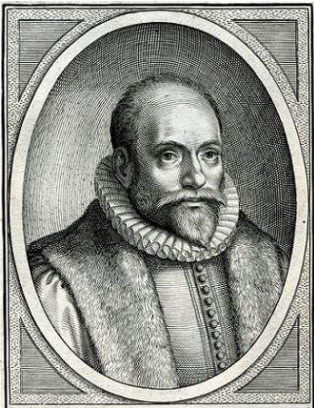
James (Jacob) Arminius

James Arminius (1560-1609) is generally regarded as the founder of the system of Arminianism. He was educated at the new Dutch University at Leyden and then at Geneva under the tutelage of Theodore Beza, Calvin’s well respected follower and successor. Around 1591, after only a year at the Geneva Academy, he began to develop views that were to become diametrically opposed to the doctrines of free and sovereign grace that were taught at Geneva. He departed and continued his education elsewhere. He became a minister in Amsterdam and was later invited to become Professor of Divinity at the University of Leyden. It was from this point that he began propounding his theories with (guarded) vigour.