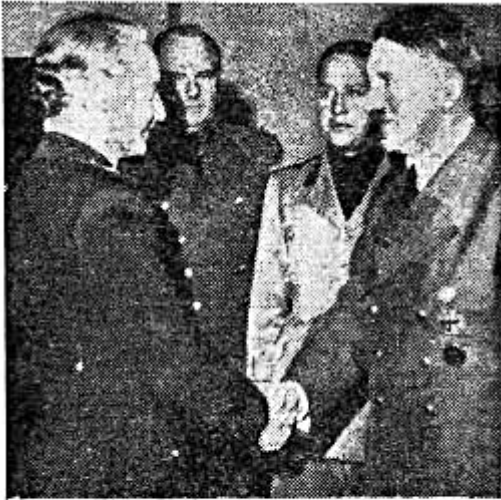
Hitler greets Serrano Suñer, Chief of the Spanish Falange and Head of the Superior Council of Spanish Religious Missions Abroad.