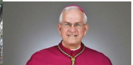
Photo of Roman Catholic Cardinals and Bishops